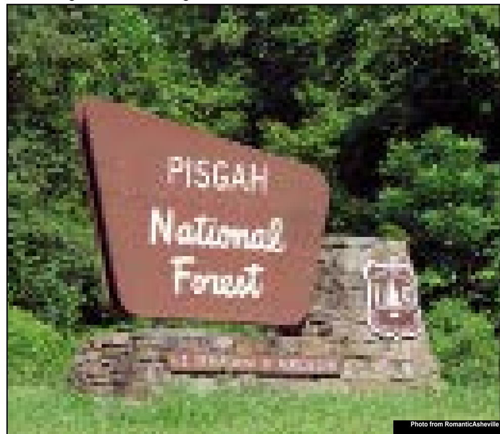
Entrance sign to Pisgah National Forest.

Another incredibly popular activity is rock climbing. Brevard is known for its climbing community and has some very famous slabs to work your way up as well as several good bouldering options. Whether you are brand new to the sport, or are a seasoned veteran, Brevard has options for you. Some close-by climbs include Looking Glass Rock, Laurel Knob and Cedar Rock, all of which are guaranteed to have fantastic views.