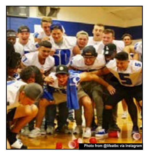
BC football players participate in game at pep rally.