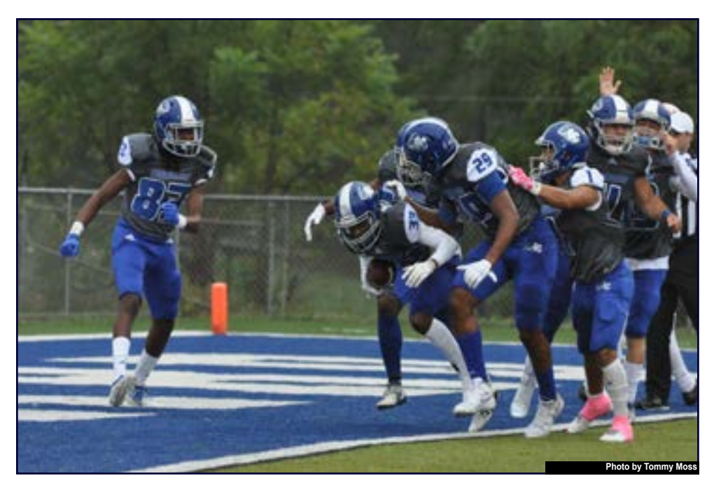
BC special teams celebrates a touchdown.