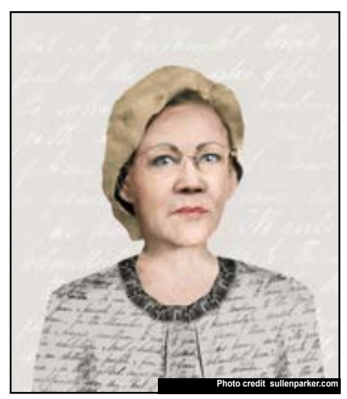
Portrait of U.S. senator Elizabeth Warren now on display at Spiers Gallery.