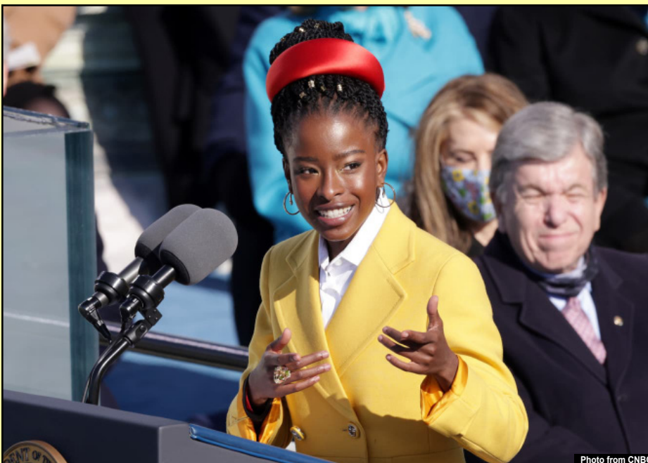
Amanda Gorman reads her poem "The Hill We Climb" at the Biden/Harris inauguration.

"Now more than ever, the United States needs an inaugural poem," Gorman said. "Poetry is typically the touchstone that we go back to when we have to remind ourselves of the history that we stand on, and the future that we stand for."