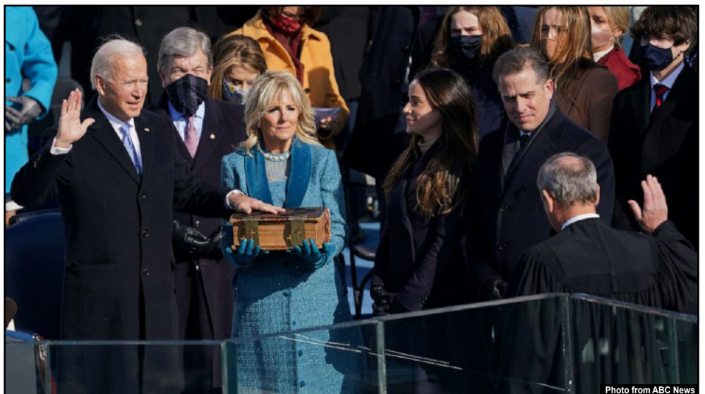
Joe Biden takes the oath of the presidential office from Chief Justice John Roberts on the steps of the U.S. Capitol Jan. 20, 2021.

✉ Letters Policy: The Clarion welcomes letters to the editor. We reserve the right to edit letters for length or content. We do not publish letters whose authorship cannot be verified.