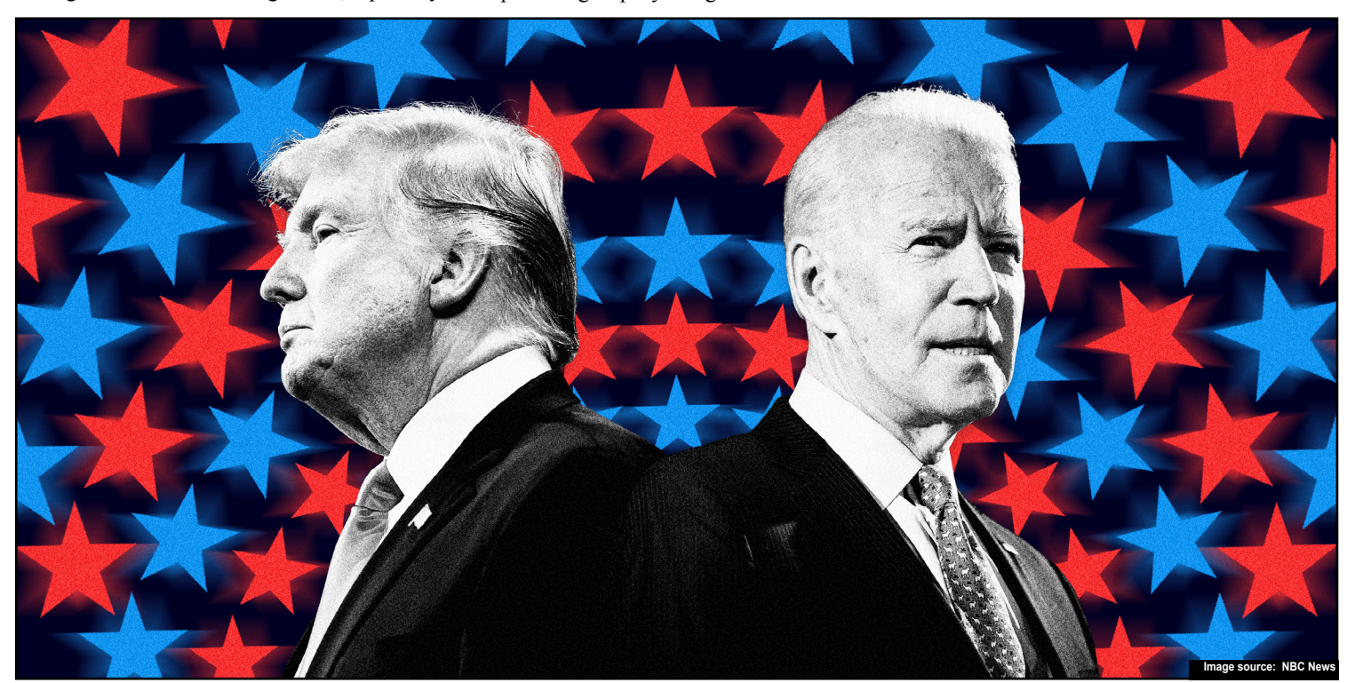
The race to 270 gets closer and closer as Trump and Biden continue to win more states.

Updates will be given by major new sources throughout the day as votes continue to be counted, but the winner may not be announced until later in the day or even into this week. It is uncertain when the new president will be announced as every hangs on to their chairs and braces for whatever comes their way.