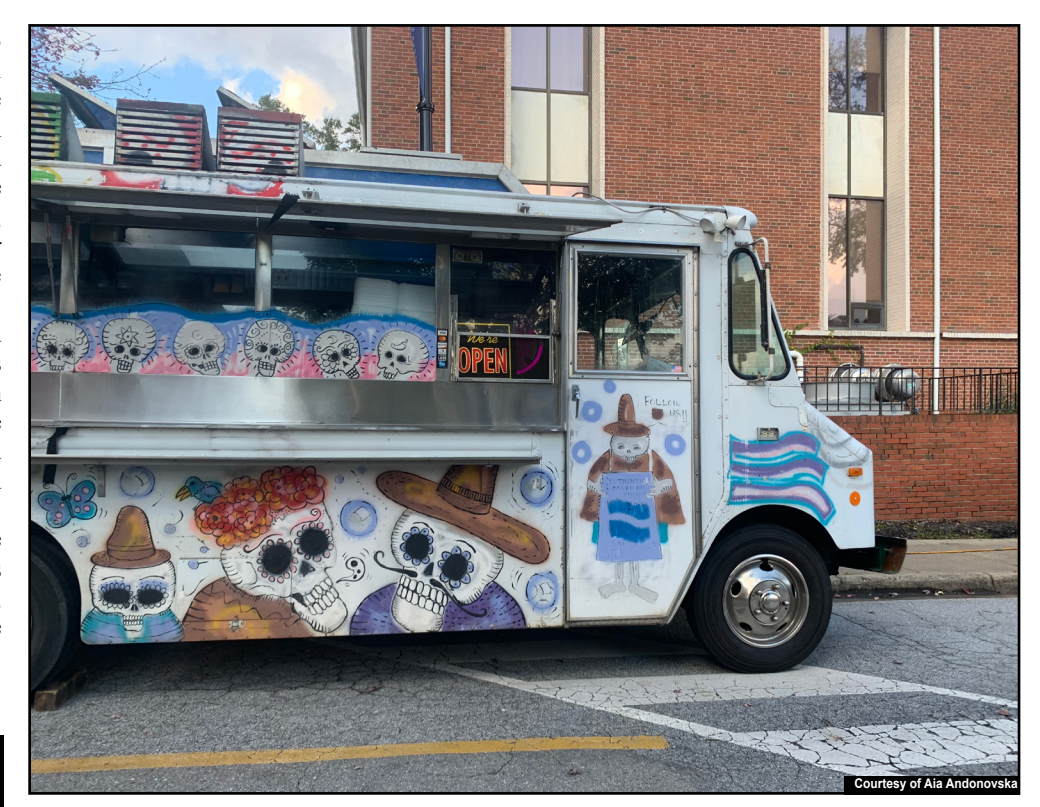
The Mexican food truck, Papa's Express, at Mini Harvest Fest.