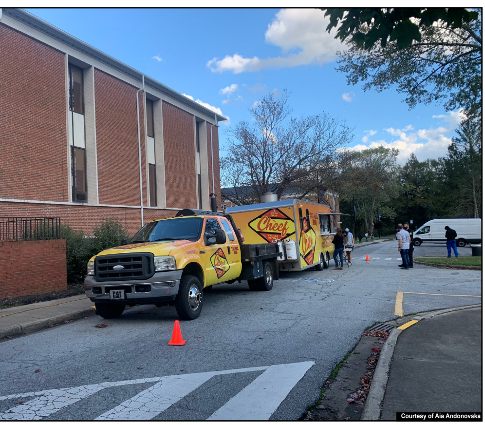
The barbeque food truck The Cheef, at BC's Mini Harvest Fest.

Letters Policy: The Clarion welcomes letters to the editor. We reserve the right to edit letters for length or content. We do not publish anonymous letters or those whose authorship cannot be verified.