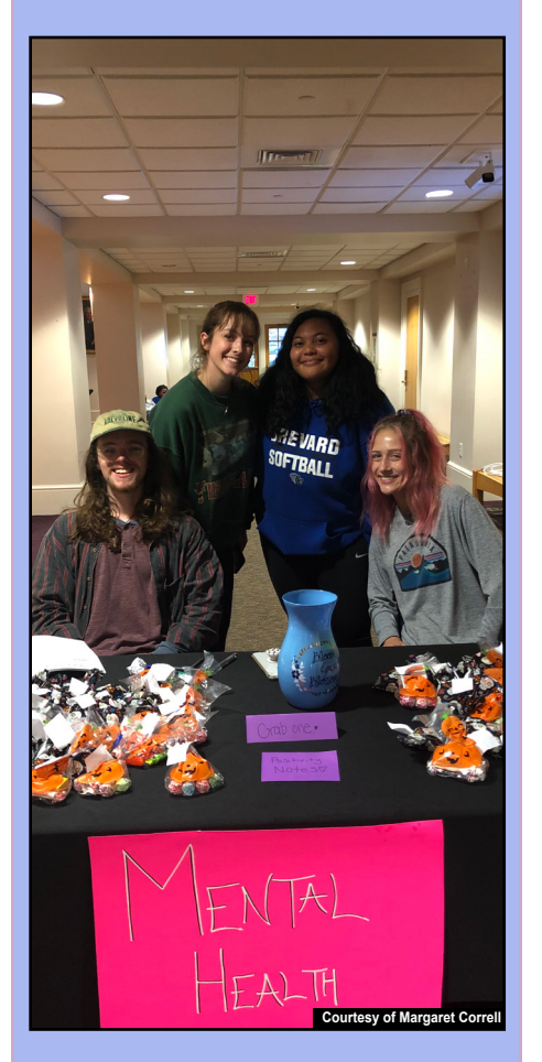
Psychology students pose at last year's Self Care event.

The Psychology Honors Society (PSI CHI) will be hosting a Self-Care Event in Boshamer Gym from 7:15 p.m. to 9 p.m. on November 18, 2020. There will be gift bags with candy and encouraging notes as well as activities. The activities will include an arts and crafts section, meditation, yoga, a writing workshop, guided instructions, therapy dogs and video games. There will be a container of wipes there to keep things clean and hand sanitizer. Everyone that attends will be required to wear a mask, no exceptions. We want this to be a time for everyone to relax and take their minds off of exams for just a few hours. Self-care is an important part of life and that is something we want everyone to take away from this experience. We hope to see you there!