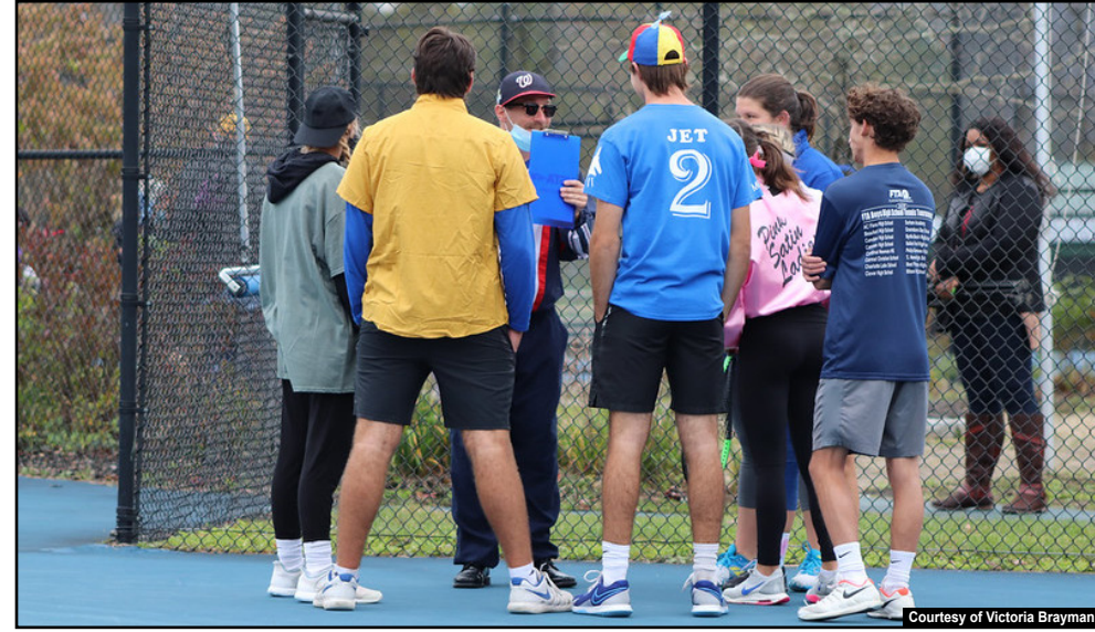
BC Tennis' blue team goes in for a huddle before the start of the match.