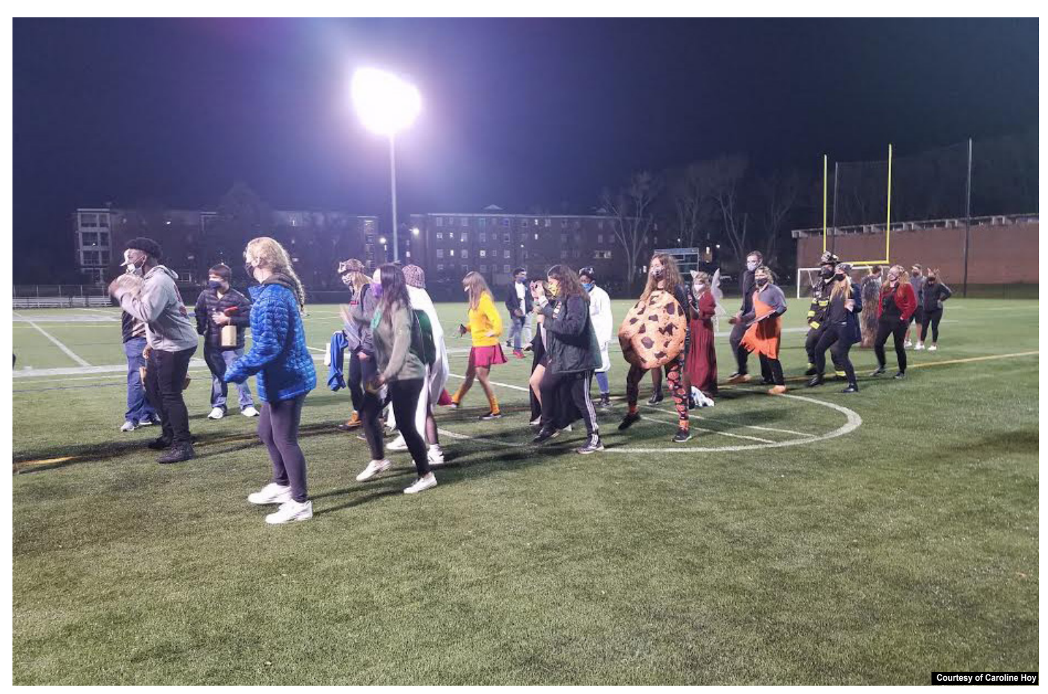
Students participate in 'Drunk or Treat', dressed up in costumes.

Overall everyone seemed to have a great time. The flyers must have been right, it was a spooky blast!