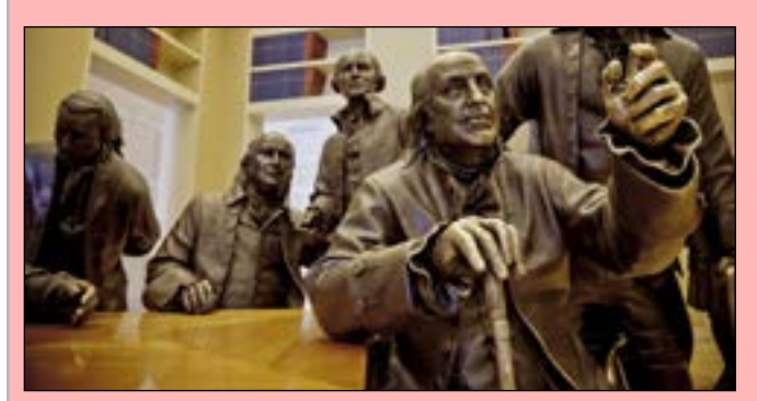
Signers' Hall in Philadelphia features 42 life-size, bronze statues of the Founding Fathers.

Be sure to stop by and say hello to your student leaders, and pick up your own copy of the US Constitution.