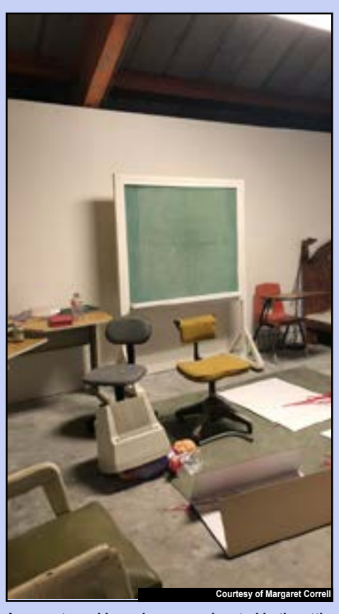
A current, working crime scene located in the attic of MG.

The new attic space is open to specific classes and is considered an "active crime scene." Permission is needed to gain access to the space.