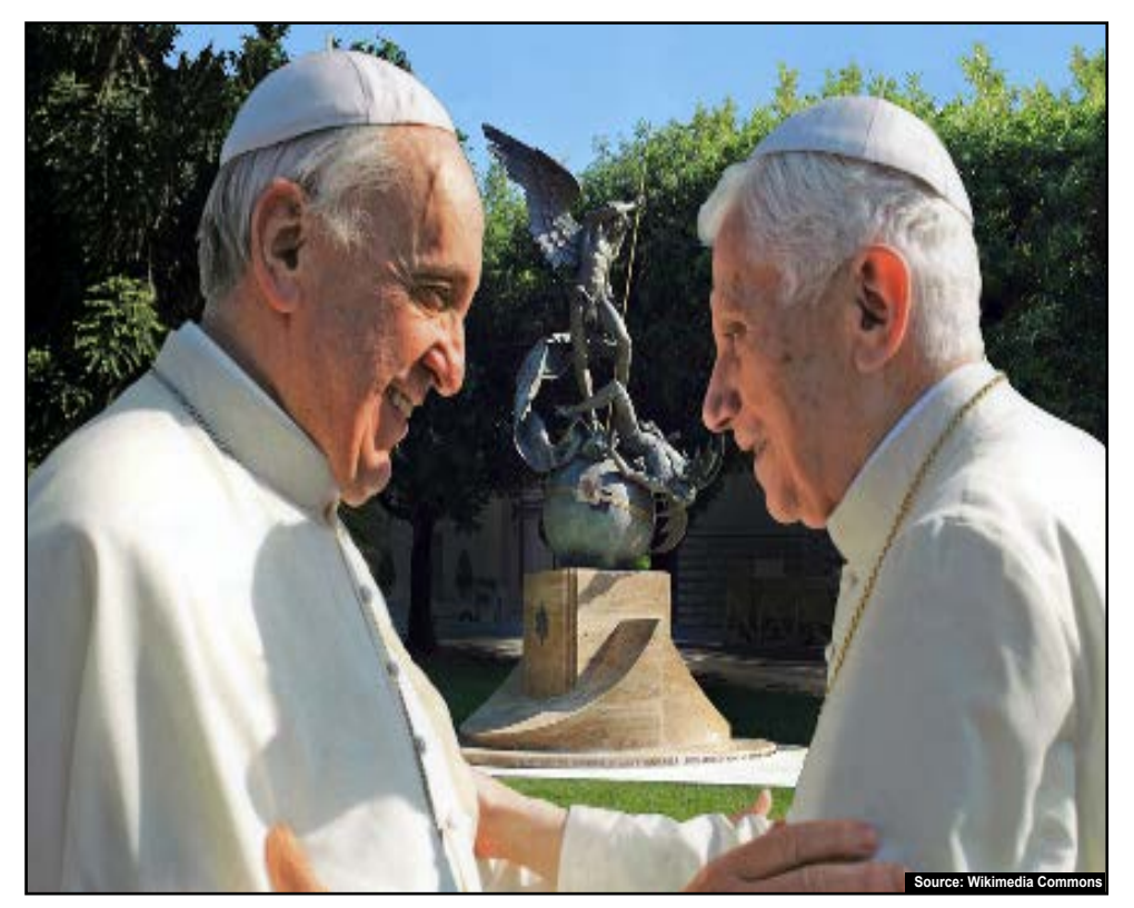
Meeting between Pope Francis and Pope Benedict XVI on the occasion of the inauguration of the statue of St. Michael the Archangel in the Vatican Gardens

"The priesthood of Jesus Christ causes us to enter into a life that consists of becoming one with him and renouncing all that belongs only