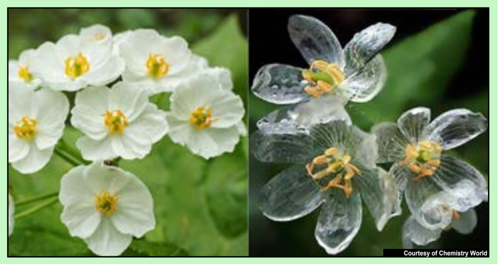
The Skeleton Flower

Since this species of flower is Asian in origin, being found in China and Japan, they will not be found on your regular hikes through the Southern Appalachians. Sadly the one species, Diphylleia cymosa, that is found in the Appalachians does not have this unique color changing ability.