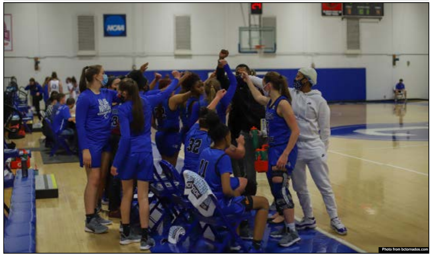
The BC women's basketball team huddles up before a game.