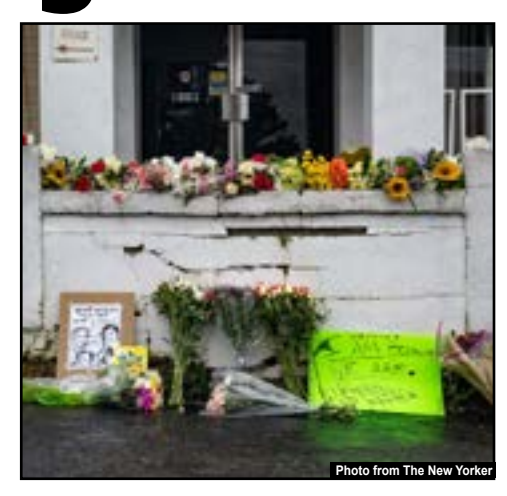
A memorial dedicated to the victims of the Atlanta shooting.