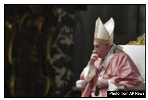
The Vatican backpedals on same-sex marriage

The Vatican is hurting those whose lives they are unfamiliar with, and this is a devastating announcement for LGBTQ people.