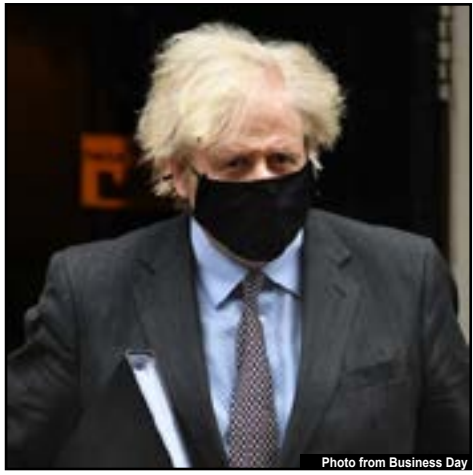
Prime Minister Boris Johnson

Step four is dependent on all the previous steps and will happen no sooner than June 12, will include the following, according to CNN: "... see the removal of most social restrictions and the return of nightclubs. Personal life