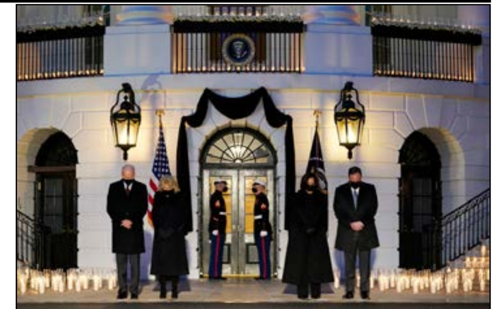
President Biden holds candlelit ceremony to mourn the loss of 500,000 Americans due to COVID-19.