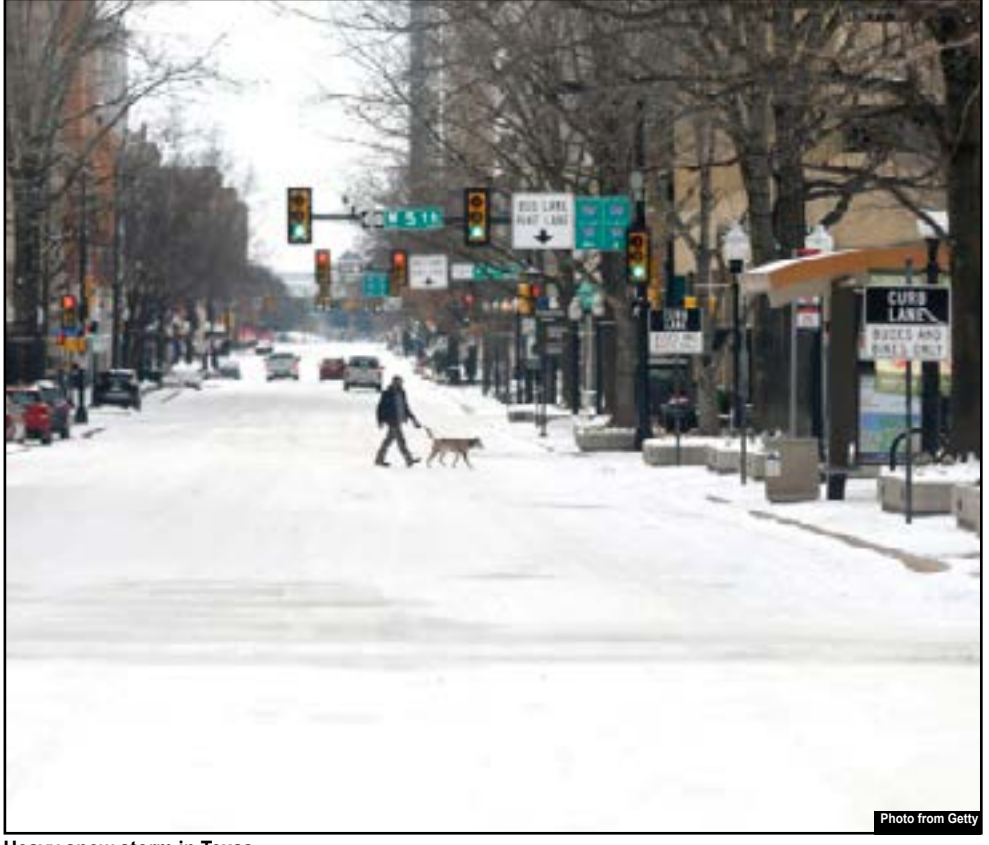
Heavy snow storm in Texas.

Some out there might still be screaming "hoax." That's fine, they can believe whatever fairytales they would like to, but climate change is still a problem. Hurricanes are getting bigger and stronger, with more droughts and heatwaves. Sea levels are on the rise. Climate change is not just global warming. Climate change is definitely not a hoax or a fairytale and will continue to become a larger problem. Who knows, maybe soon it will be Florida that is covered in snow with power outages across the state.