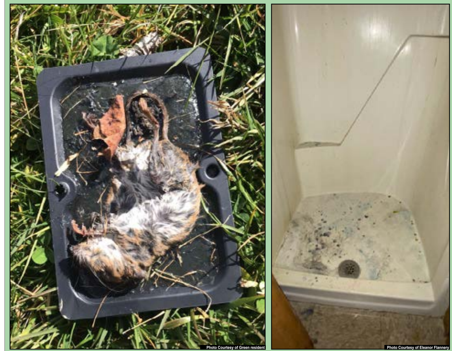
A rodent caught by a Green Hall resident.

Currently, students living in Green can only hope that the staff and facilities are working their hardest to provide them with a stable living environment as they have stated. Students are becoming more and more exhausted with having to deal with repeated troubles; this is where they live. They have gotten comfortable with discomfort, which can be seen as troubling. While renovations have been seen happening on the outside entrance structure, residents are yearning for a revamp inside.