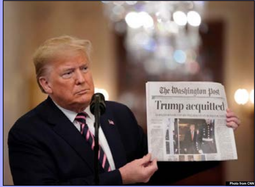
Donald Trump holds up a copy of The Washington Post demonstrating his first acquittal.