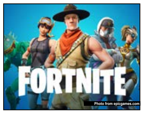
Characters dressed in new skins from the game.

As of right now Fortnite is still booming with all of their new updated modes and skins it's hard to really say when it will come down from it's boom with all the dedicated fortnite players. But when it does come down will Epic Games have a new game for everyone to go crazy over, being a lover of Fortnite I sure hope so.