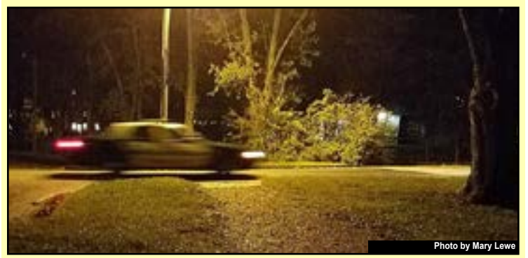
A police car leaving campus late Saturday night after a party was broken up in the Villages.