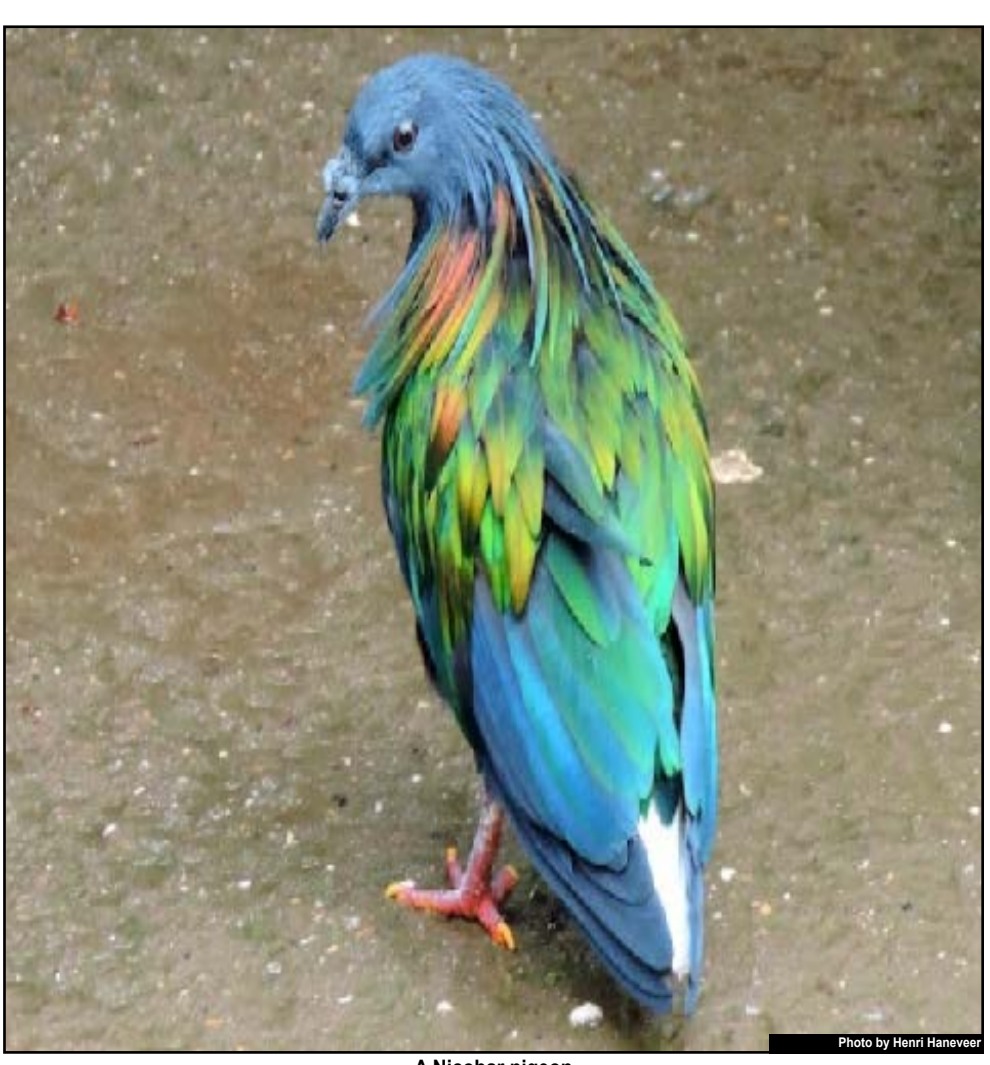
A Nicobar pigeon

Letters Policy: The Clarion welcomes letters to the editor. We reserve the right to edit letters for length or content. We do not publish letters whose authorship cannot be verified.