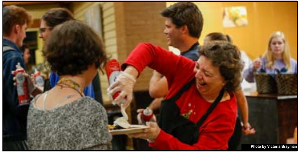
Students receive pancakes made and decorated by faculty and staff.