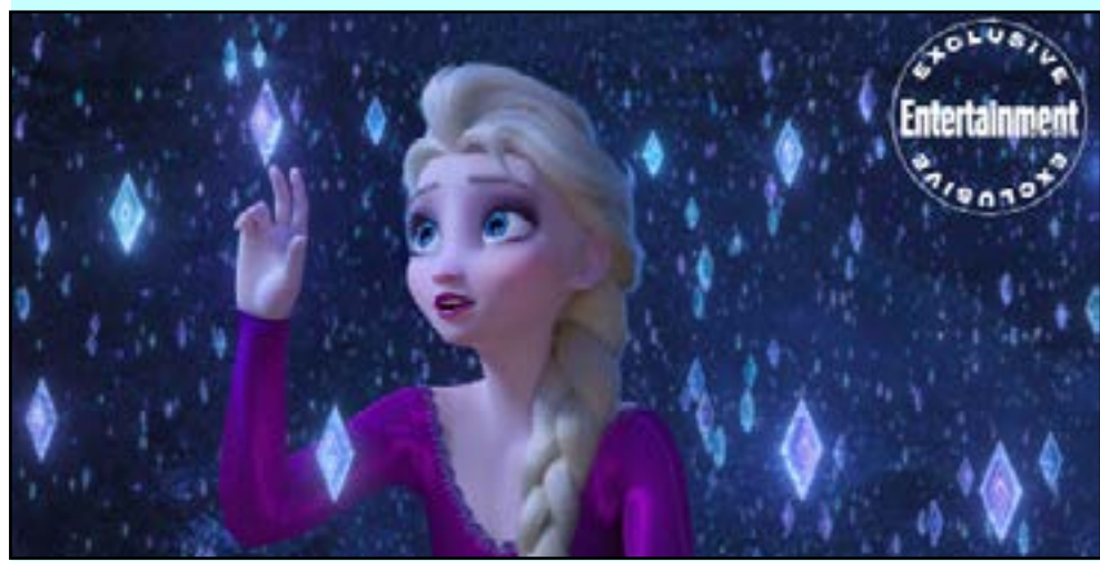
A still from Disney's 'Frozen 2."

Also make sure you wait till the end of the movie to see the end credit scene with Olaf!