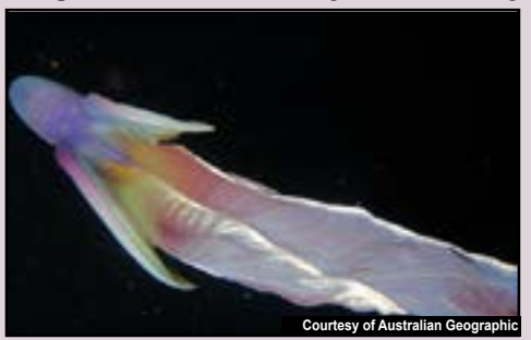
Blanket Octopus reveals unfurled blankets.

Copulation occurs in a strange and life ending