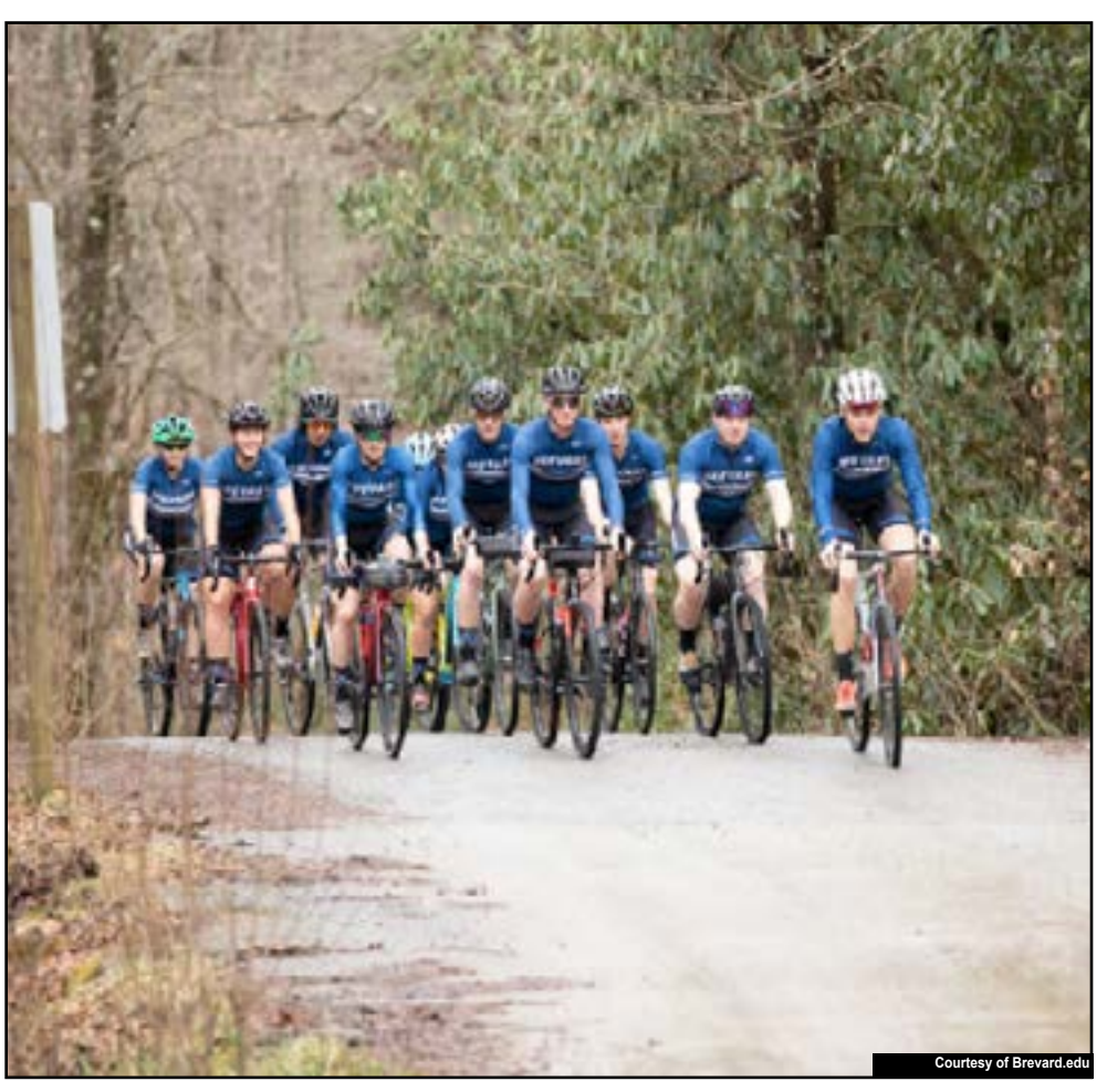
Brevard College Cycling team practices together on gravel road.

To follow the latest news and updates surrounding Brevard College Athletics, follow the Tornados on Twitter and Instagram @ bctornados, like 'Brevard College Athletics' on Facebook, and subscribe to 'Brevard College Tornados' on YouTube and SoundCloud. Also, follow 'brevardcollege' on Flickr for the latest photos from all Brevard College events.