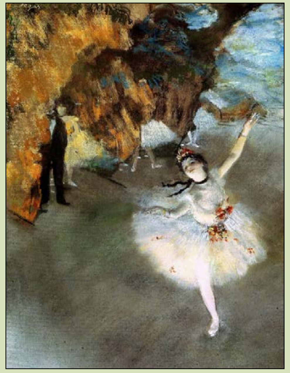
Edgar Degas, "The Star," 1877, pastel

"The Star" is the quintessence of Degas's individualism as an artist. It is the marriage between traditional and contemporary style that secured Degas's lasting impression on art.