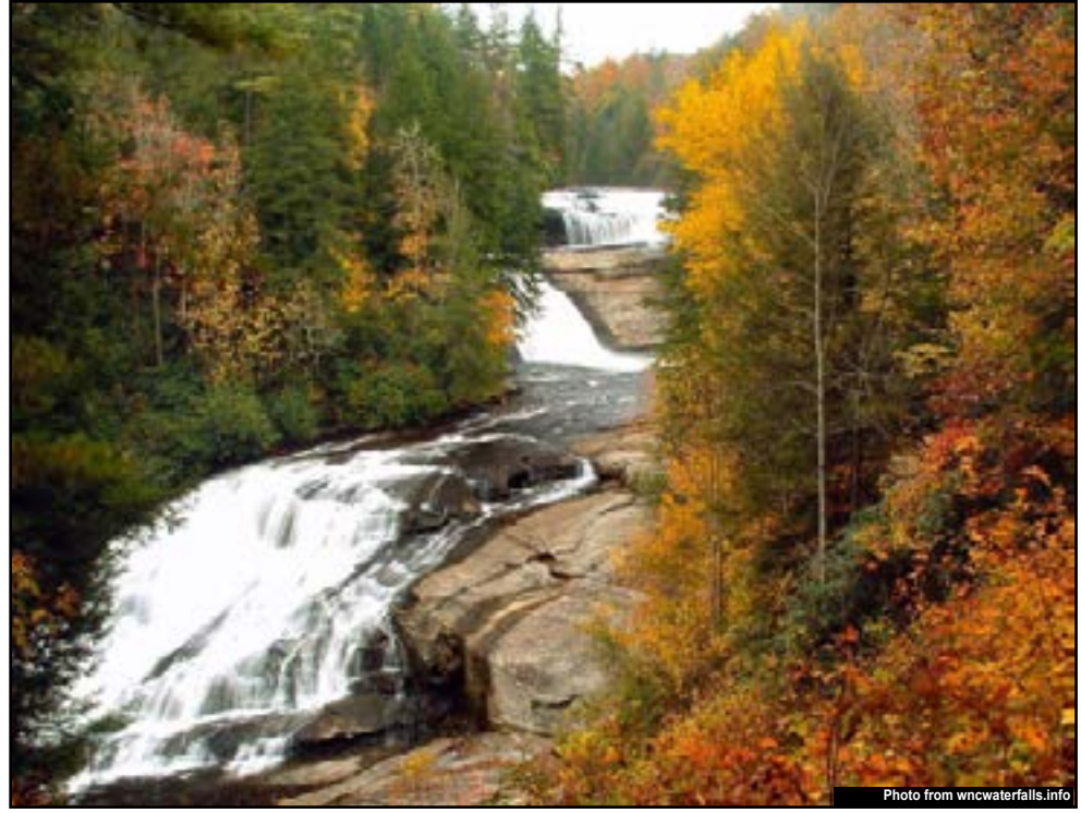
Dupont's Triple Falls in its autumn glory (now just a few weeks away).

At the beginning you also walk along the base of the river and pass people and dogs swimming and maybe even a few people fishing for trout, then there is a wooden outlook that is looking over the top of the waterfall and people swimming in the water hole at the bottom of the fall.