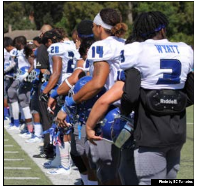
Members of the Brevard College football team watch the game from the sidelines.

Following Saturday night's showdown, the Tornados will hit the road for the first time in the 2019 season to face the Allen University Yellow Jackets (1-0) in Columbia, South Carolina on Saturday, Sept. 28 at 5 p.m. The two schools met in last season's finale, where the Tornados took a 46-10 victory at Brevard Memorial Stadium on Saturday, Nov. 17, 2018.