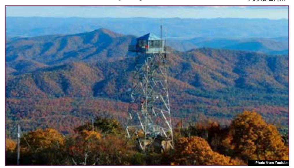
A view of Fryingpan Tower, located on the Blue Ridge Parkway.