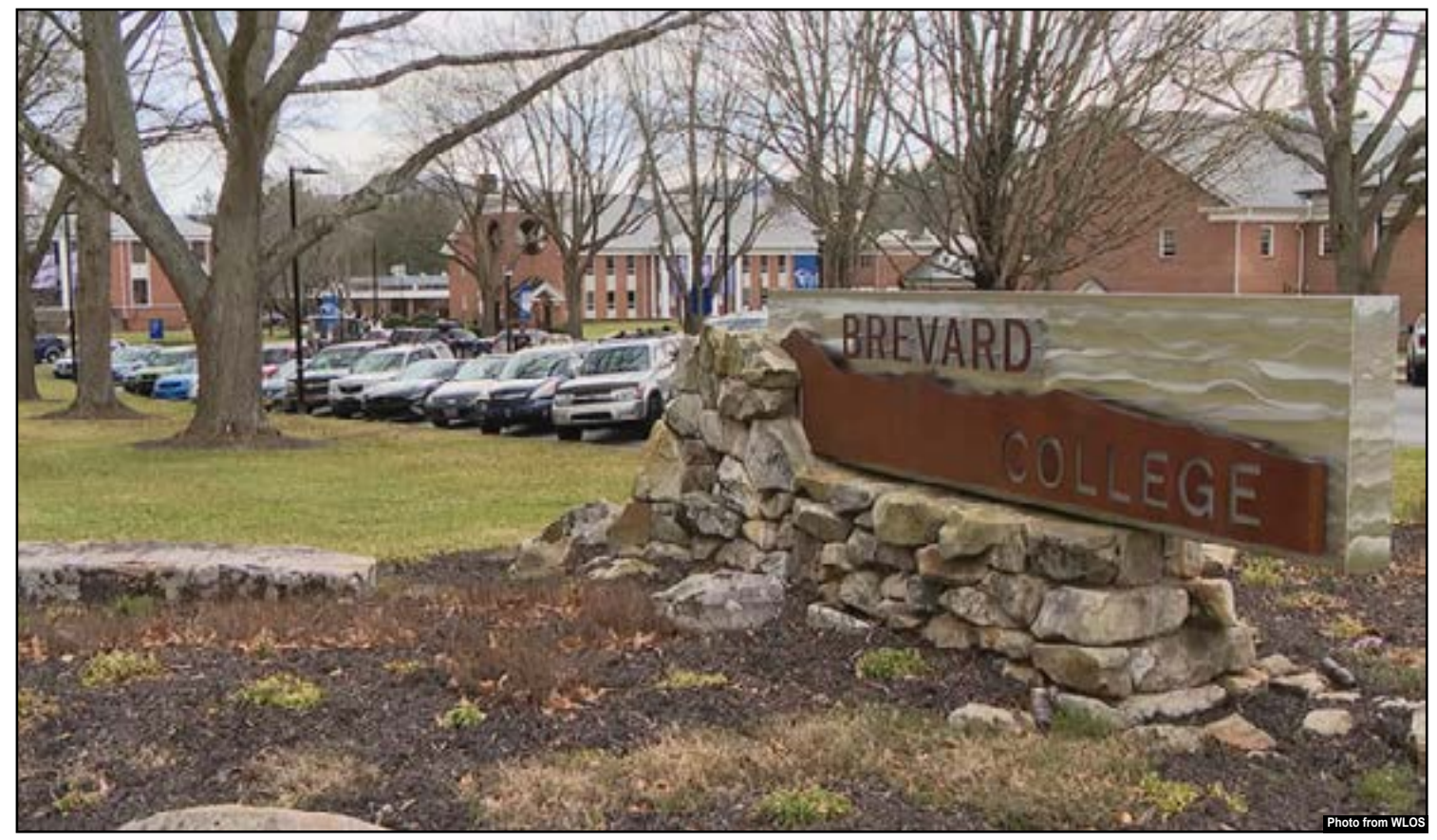
Brevard College and BC Athletics make questionable decisions regarding COVID-19 testing protocol.

This year and this season mean a lot to student-athletes around the country, but potentially jeopardizing the health of young people does not seem like it is worth playing a season.