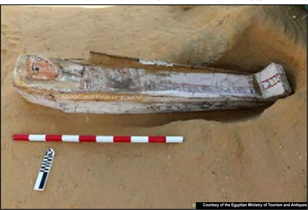
One of King Teti's worshippers.

Other discoveries at the site include a set of wooden masks, a shrine to the Egyptian god Anubis, bird-shaped artifacts, ancient board games, a bronze ax and hieroglyphs.