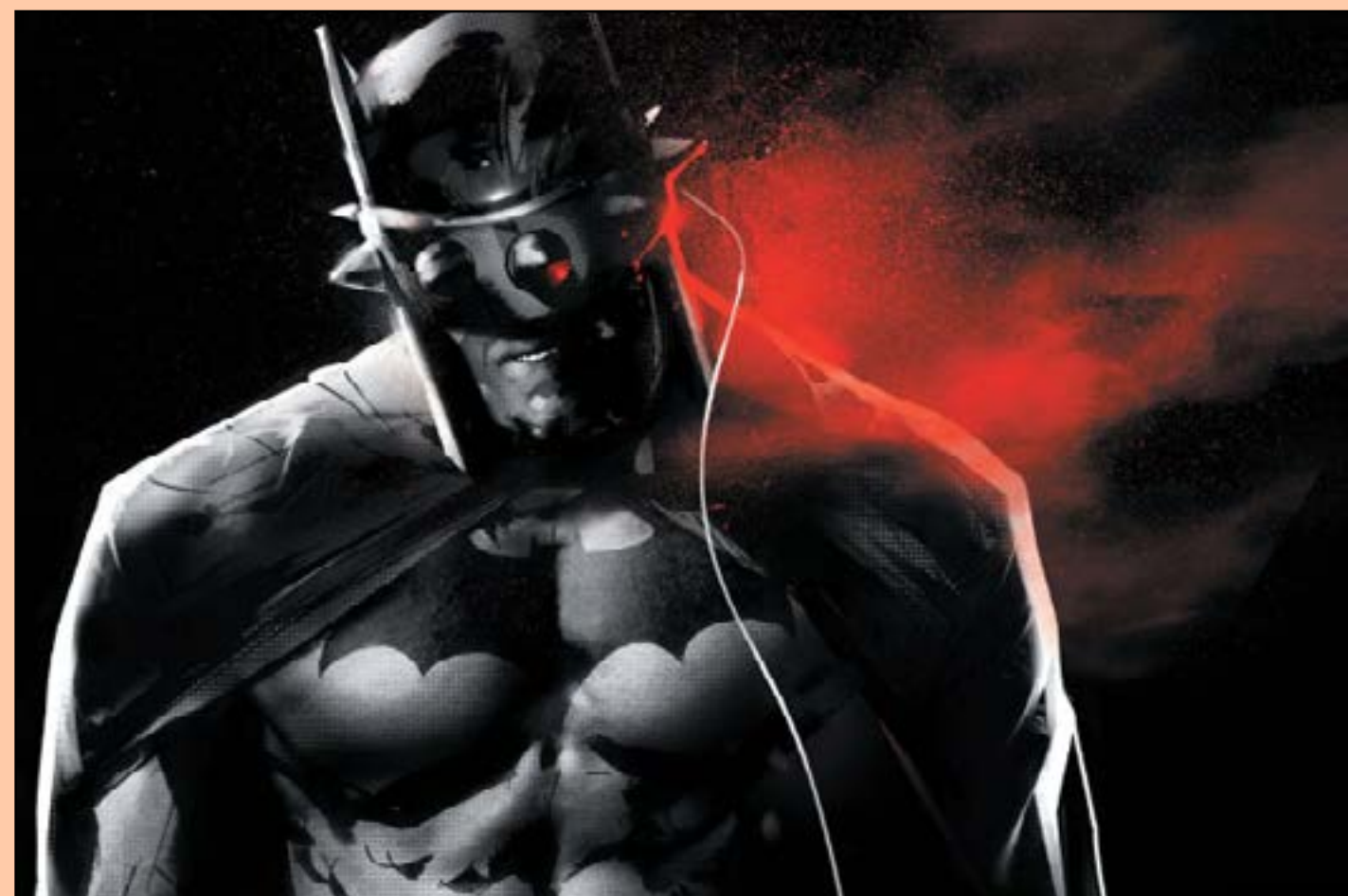
The Batman Who Laughs cover art.