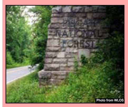
Check in with the Pisgah Rangers before venturing out into the forest.