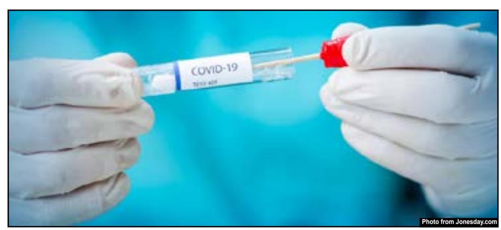
Increased testing at Brevard reveals an increase in COVID-19 cases, most among students.