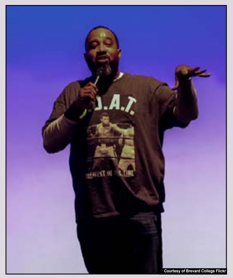
Comedian Azeem performs on stage in Ingram Auditorium.

The final act was the first year soccer girls. They were lip-syncing to a cover from one of the "Pitch Perfect" movies. They told the audience that the older soccer girls told them to do it, but the older girls denied this. All the performances were amazing.