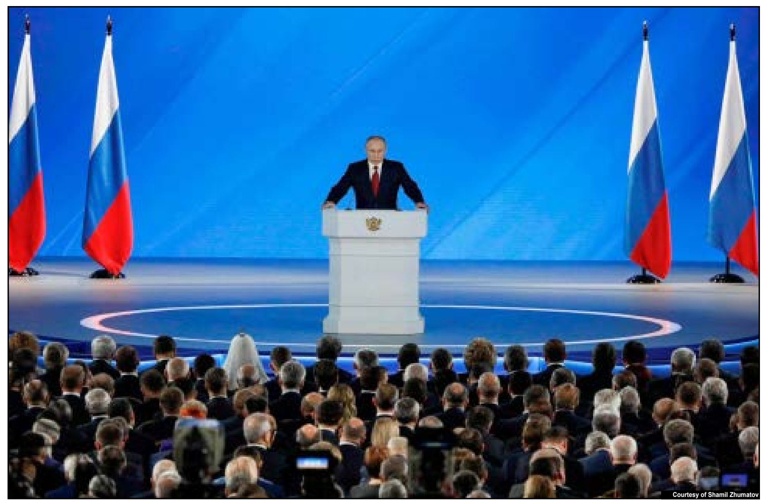
Putin addresses the Federal Assembly in Moscow, Jan. 15 2020.

These changes were immediately scrutinized by observers as efforts done by Putin to keep himself in power, as he prepares for his presidential transition in 2024. At 67 years old, Putin has ruled over Russia for two decades. The question of how he will handle the end of his presidency when it arrives in four years time has increasingly been on the minds of people. Since the declaration of the government dissolving three weeks ago, there has been no update on the conditions of Russia's government, except that they will vote on Putin's proposals come September 2020.