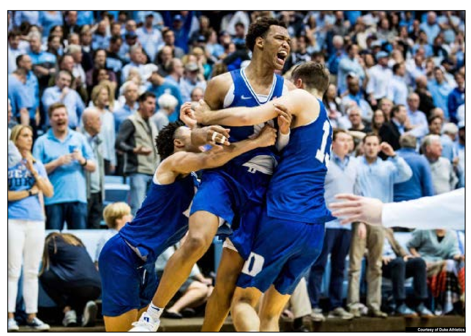
Duke stuns UNC crowd with buzzer-beater layup.

This game will be remembered as exciting and memorable, as all rival games should be. Duke will host UNC on March 7, 2020 at 6 p.m.