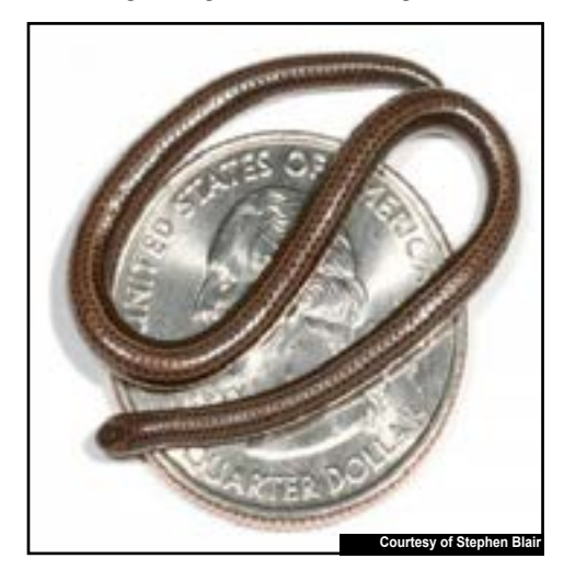
Threadsnake on quarter.

Without active conservation efforts being taken, it seems likely that this species will join the ever growing list of extinct organisms.