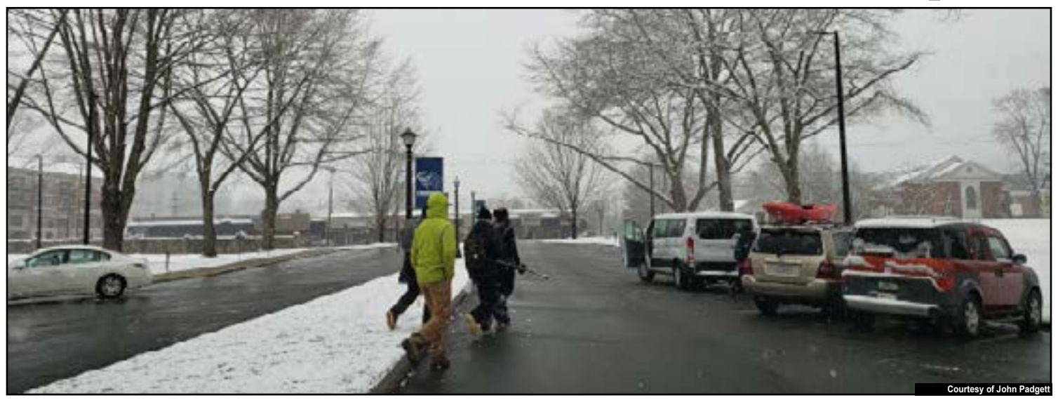
Members of the Brevard College Outing Club and friends prepare to make the trip to Appalachian Ski Mountain on Saturday, Feb. 8, where they participated in skiing and snowboarding.