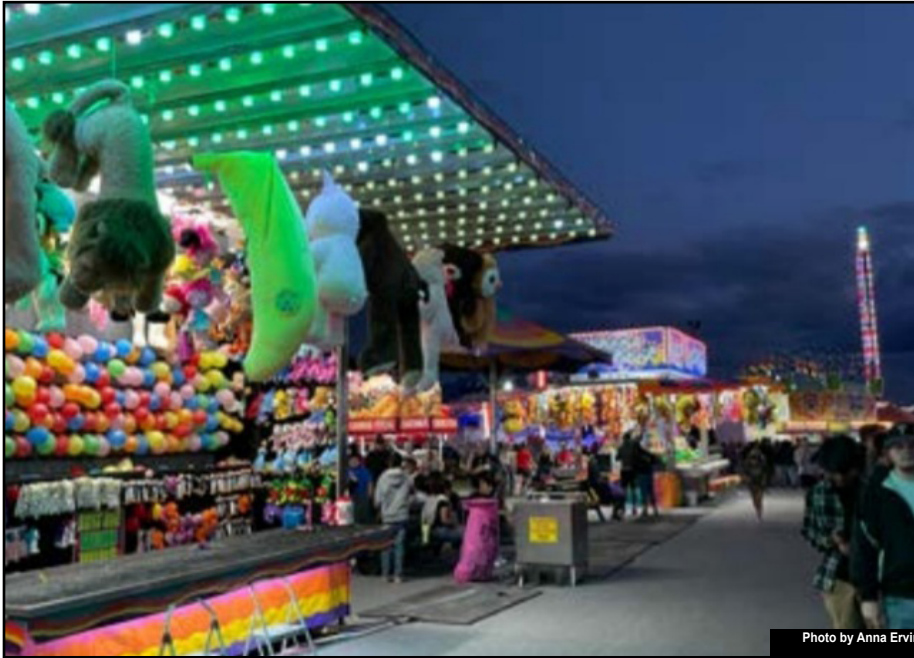
The fair games are ready to be won!