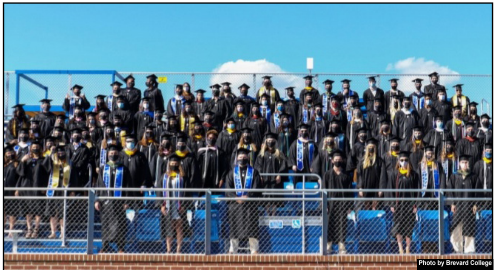
The graduating class of 2021.

✉ Letters Policy: The Clarion welcomes letters to the editor. We reserve the right to edit letters for length or content. We do not publish letters whose authorship cannot be verified.