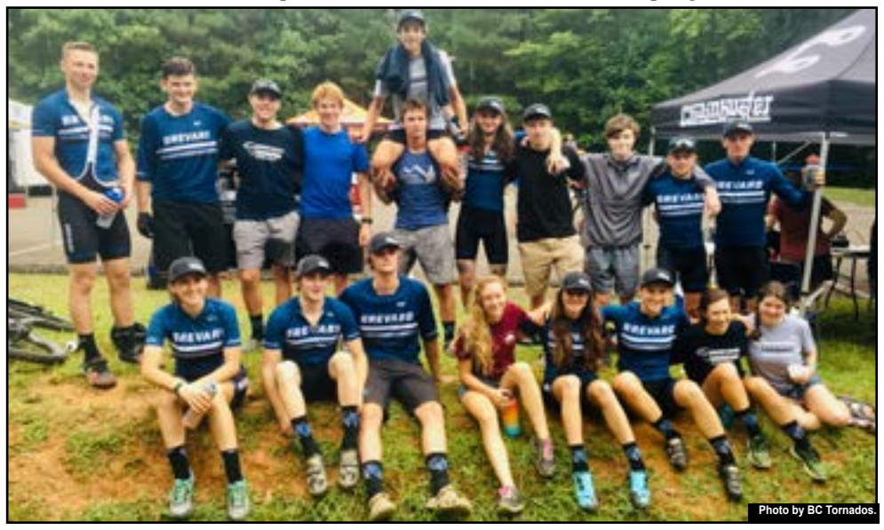
The Brevard College Cycling Team following the 2019-20 Mountain Bike season-opener in Ellijay, Georgia.

In total, Brevard College cyclists collected eight podium finishes, including two race victories in the season-opening weekend. The Tornados return to action this Saturday and Sunday at the Volunteer MTB Weekend hosted by the University of Tennessee at the Windrock Bike Park in Oliver Springs, Tennessee.