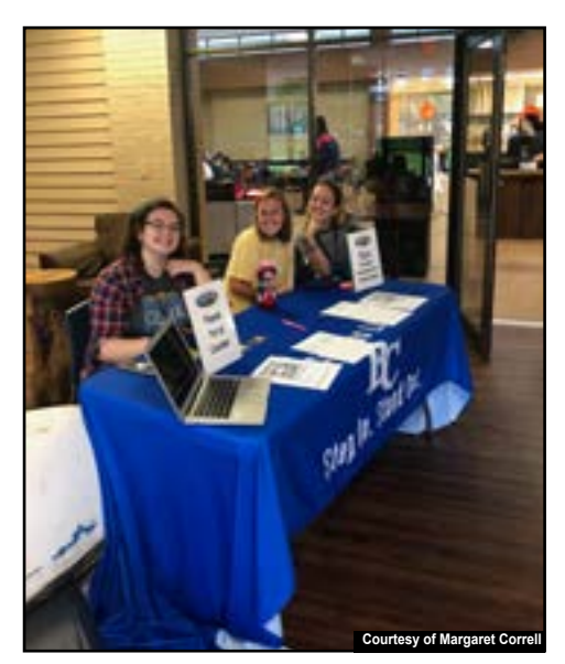
Members of SGA and Paws for a Cause smile for a picture.