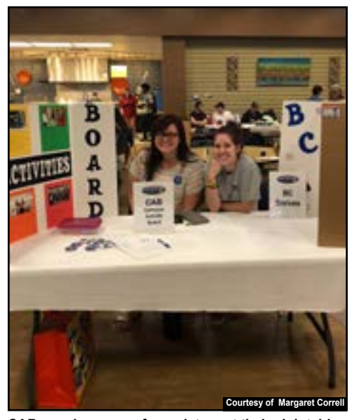
CAB members pose for a picture at their club table.