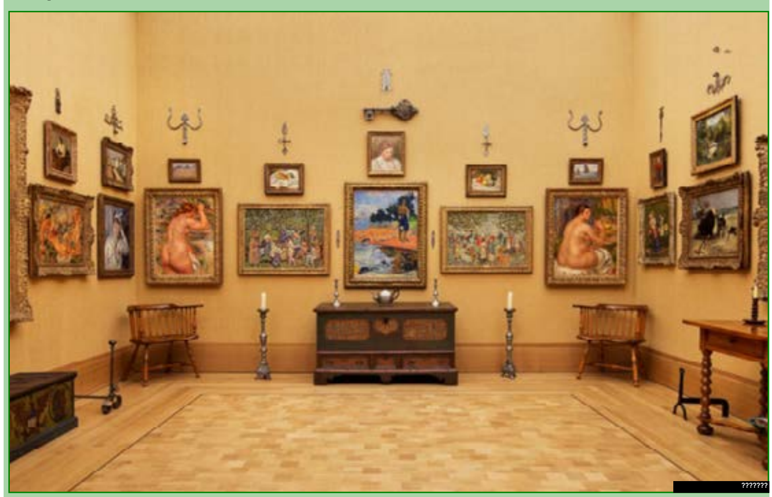
The south wall of Room 6 in the Barnes Musem in Philadelphia displays paintings by Gauguin, Renoir, Seurat and Prendergast alongside antique furniture and metalwork.

The new galleries were designed to replicate the scale and proportion of original galleries in Merion. Dr. Barnes's artistic arrangement of the artworks and furniture were reproduced to maintain the experience as he intended.