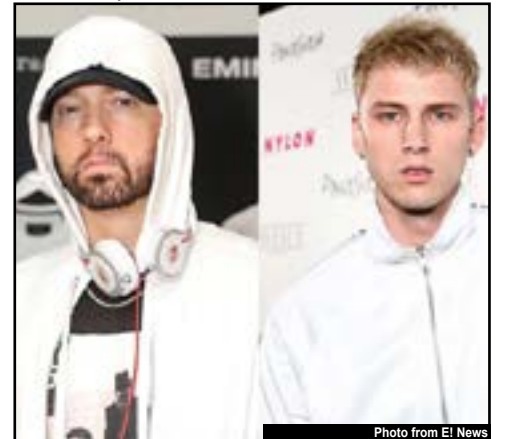
Rap beef is back. Eminem (left) and Machine Gun Kelly (right) go at it on recent tracks.

Both diss tracks were very good, but I'm sorry Kelly, you lost this one. As far as we know Kelly is not coming out with another diss. I agree with the media when they say MGK did this just to promote his new album "Binge," which is not very good. So, it stands to reason that Eminem has destroyed MGK's career.