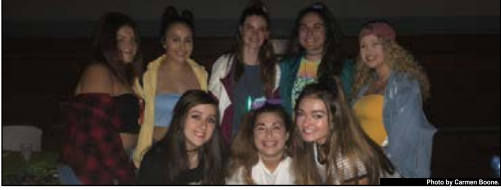
This group of friends had a great time dressing up for the 90s party on campus last week.

The party was filled with food, music, dancing, friendship and fun. The party lasted from 9:30 to 11:30 p.m. It was a night to remember and gave Brevard College students a chance to relieve some stress and have some fun.