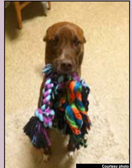
Lillie can be shy sometimes!