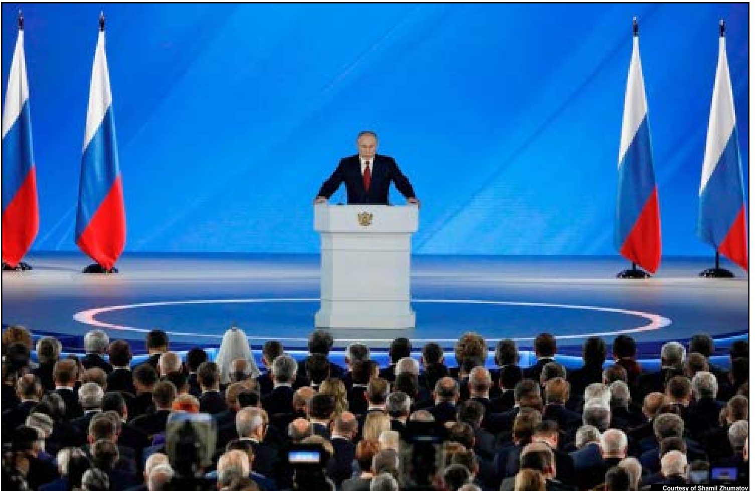
Putin addresses the Federal Assembly in Moscow, Jan. 15 2020.

These changes were immediately scrutinized by observers as efforts done by Putin to keep himself in power, as he prepares for his presidential transition in 2024. At 67 years old, Putin has ruled over Russia for two decades. The question of how he will handle the end of his presidency when it arrives in four years time has increasingly been on the minds of people. Since the declaration of the government dissolving three weeks ago, there has been no update on the conditions of Russia's government, except that they will vote on Putin's proposals come September 2020.