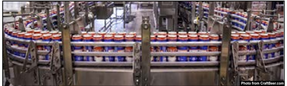
The assembly line at Oskar Blues