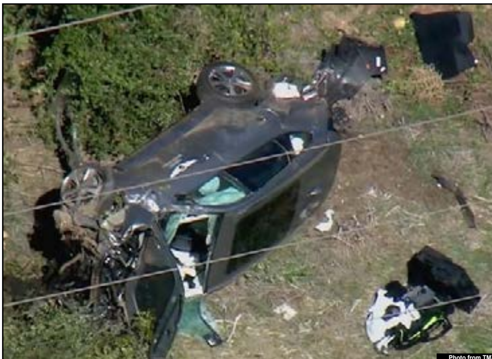
Tiger Woods' car lay completely totaled after his shocking accident.