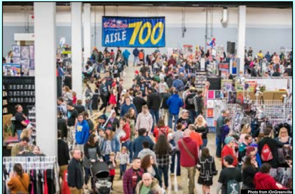
Amongst the action at Comic-Con in Greenville, SC.