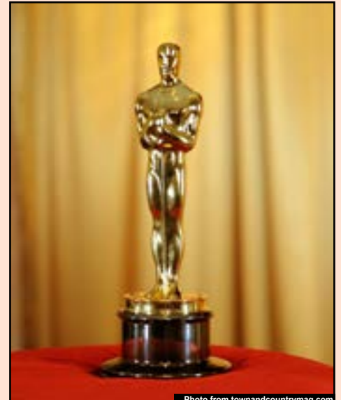
Oscars academy award trophy.

“Feeling Through” “The Letter Room” “The Present”