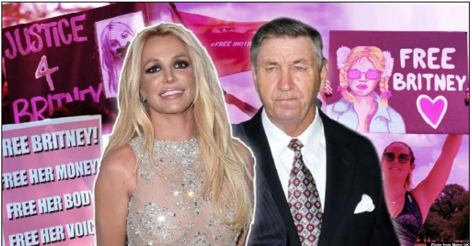
Britney Spears and her father, Jamie Spears.

If any further progress is made with ending the conservatorship, it will be known Sept. 29.