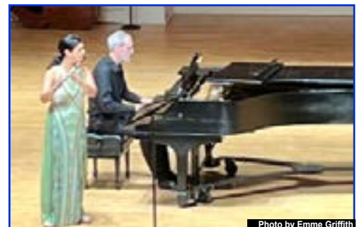
This performer vocalizes radiantly with piano accompaniment!