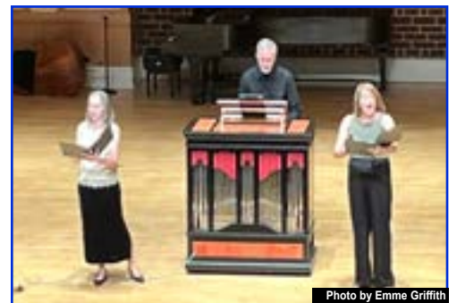
This duo dazzles the audience with song!