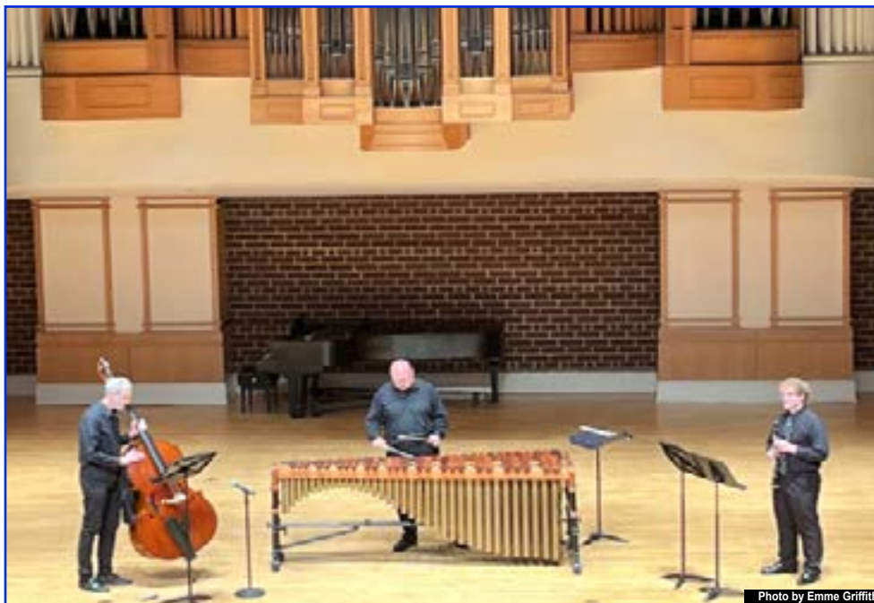
The BC Faculty showcases their instrumental talents in a group of three and rocks the house!