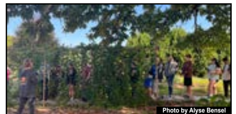
Students learn about Rosemary!