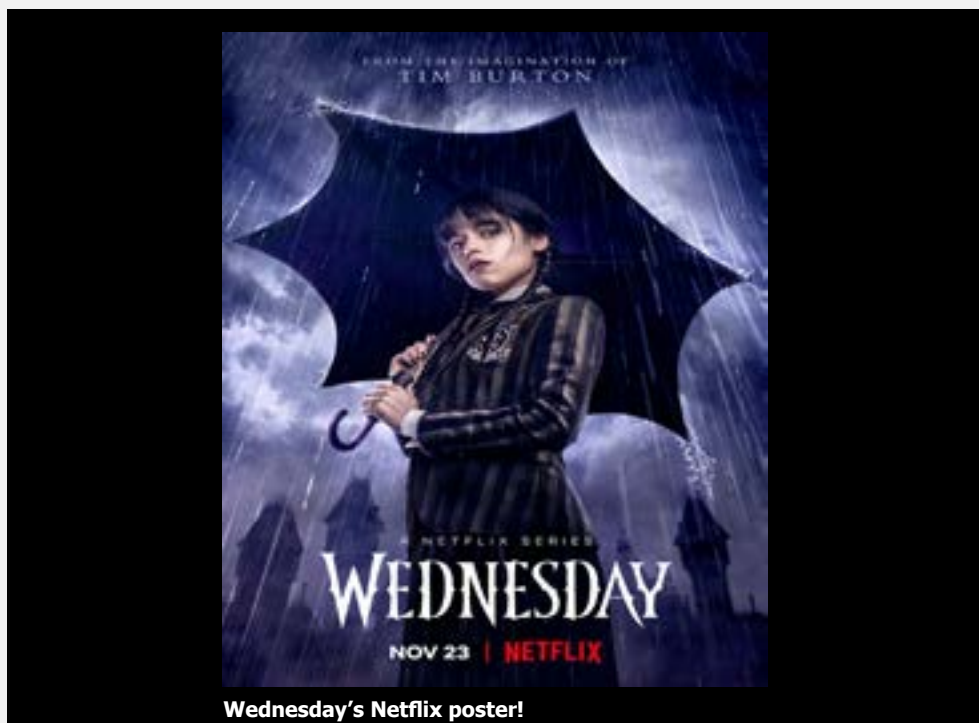
Wednesday's Netflix poster!