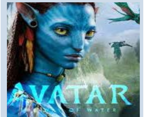
Avatar the Way of Water movie poster!