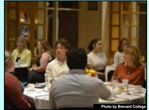
Students and hosts patiently await their next course.

I believe it would be beneficial to host two etiquette dinners each year. This way students are able to retain the information along with connecting with other students and others in the Brevard community.