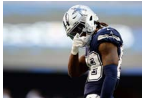
Photo of CeeDee Lamb at Cowboys game

Lamb has opened the door for many other receivers who are looking to get paid and expect that top dollar for years to come.