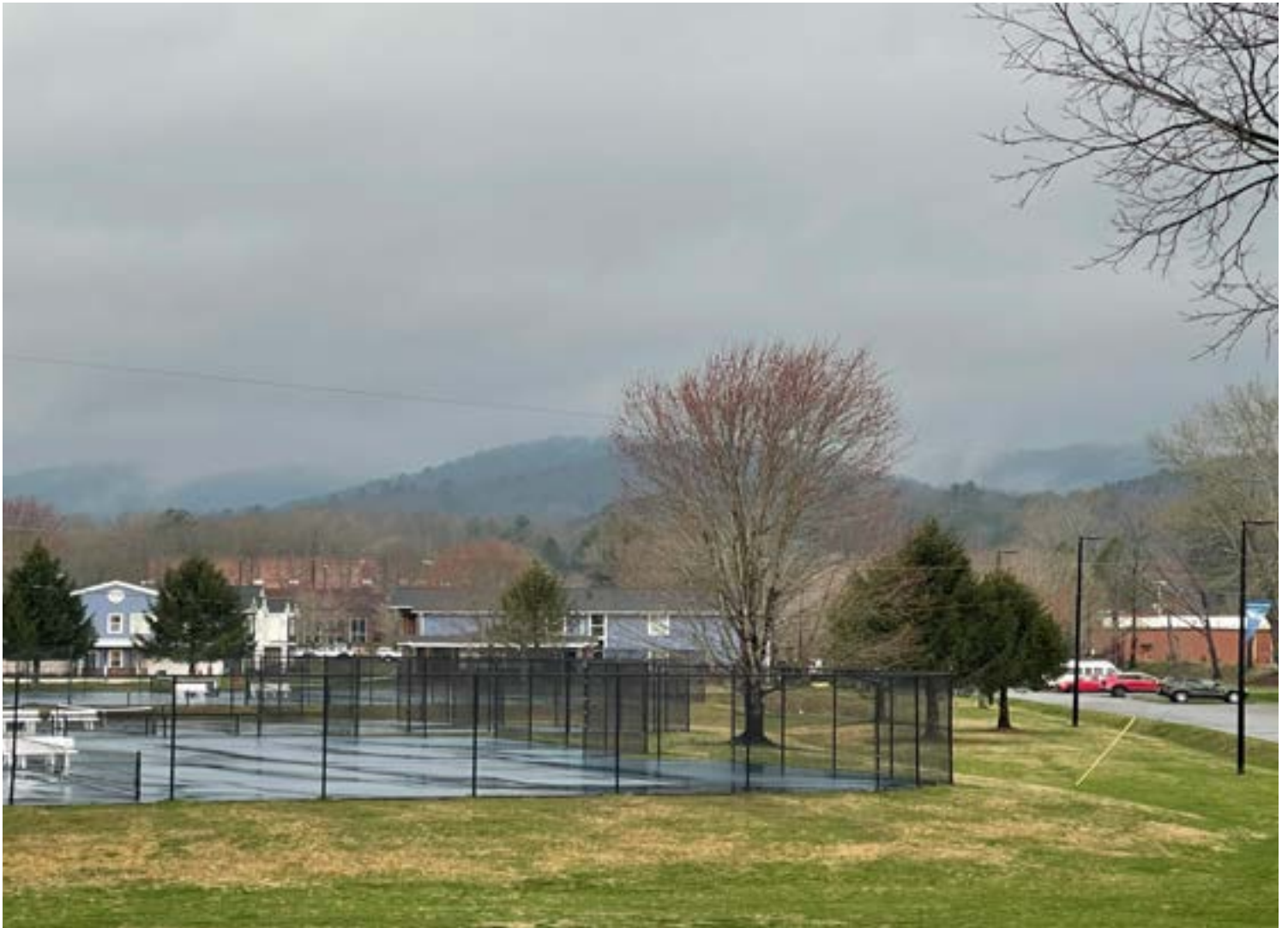
A beautiful cloudy day on the Brevard College campus.

I highly recommend trying something outside and touching some grass!