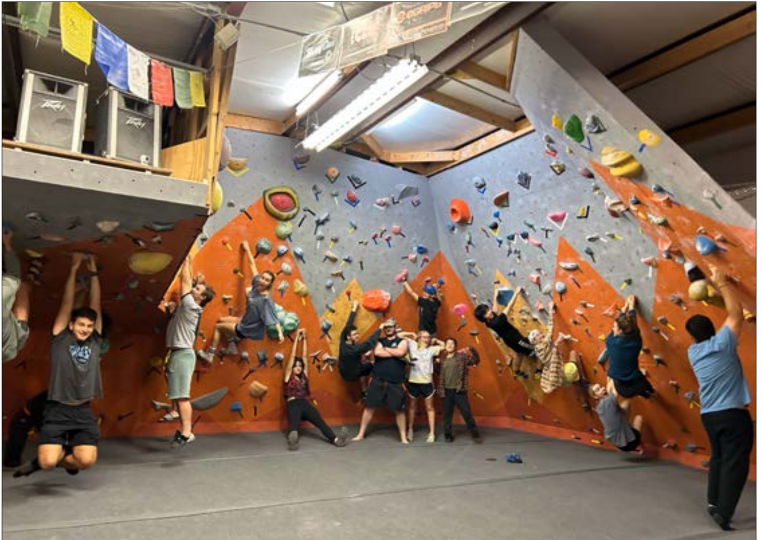
The BC Climbing Club at the Brevard Rock Gym. Meetings take place Monday and Friday starting at 7:30 p.m.

I wish everyone luck for these first few weeks of school. Go touch some grass and get outside once a day—it's good for your mental health.