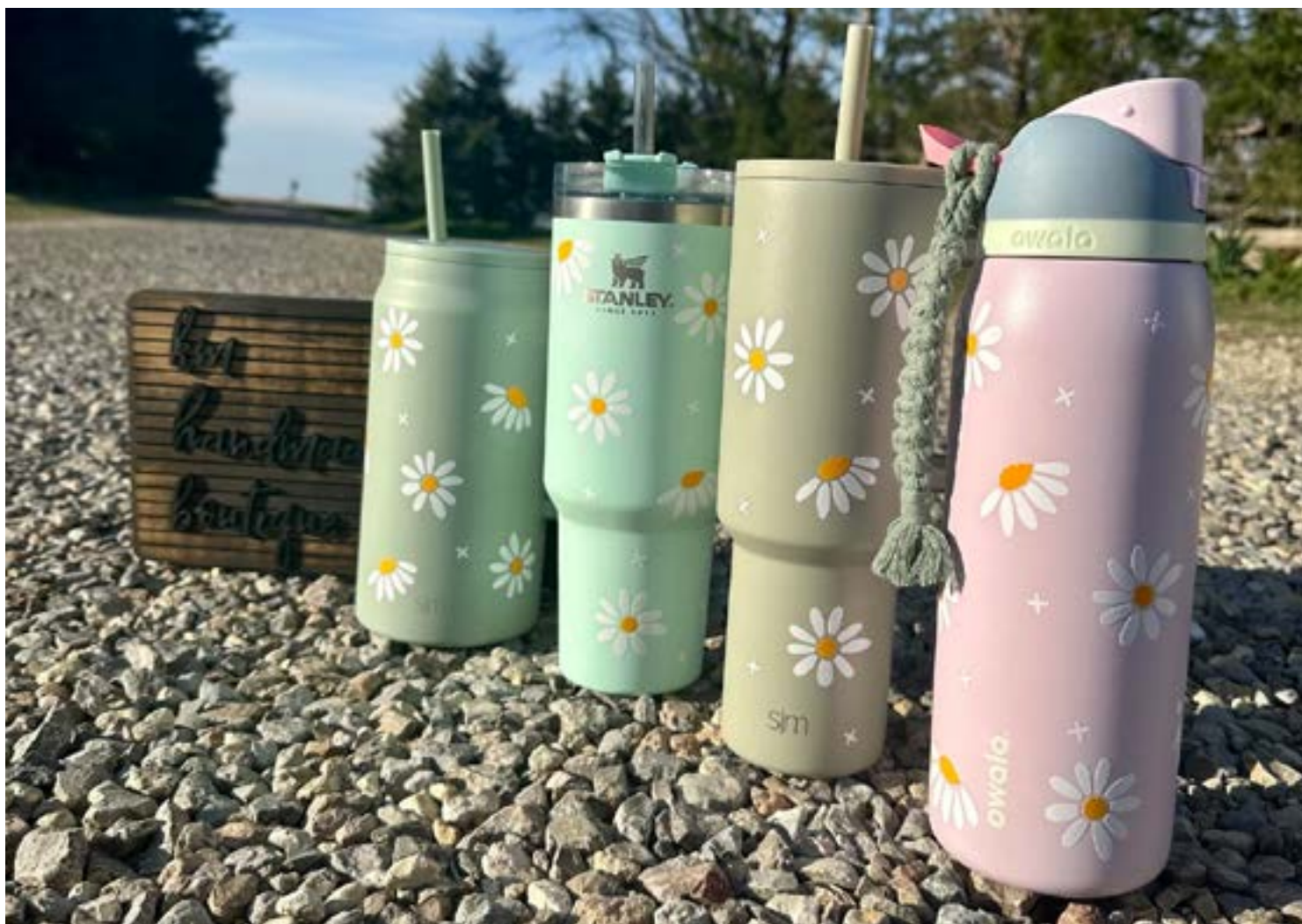
Image of Stanley, Owala, and other trending style water bottles.