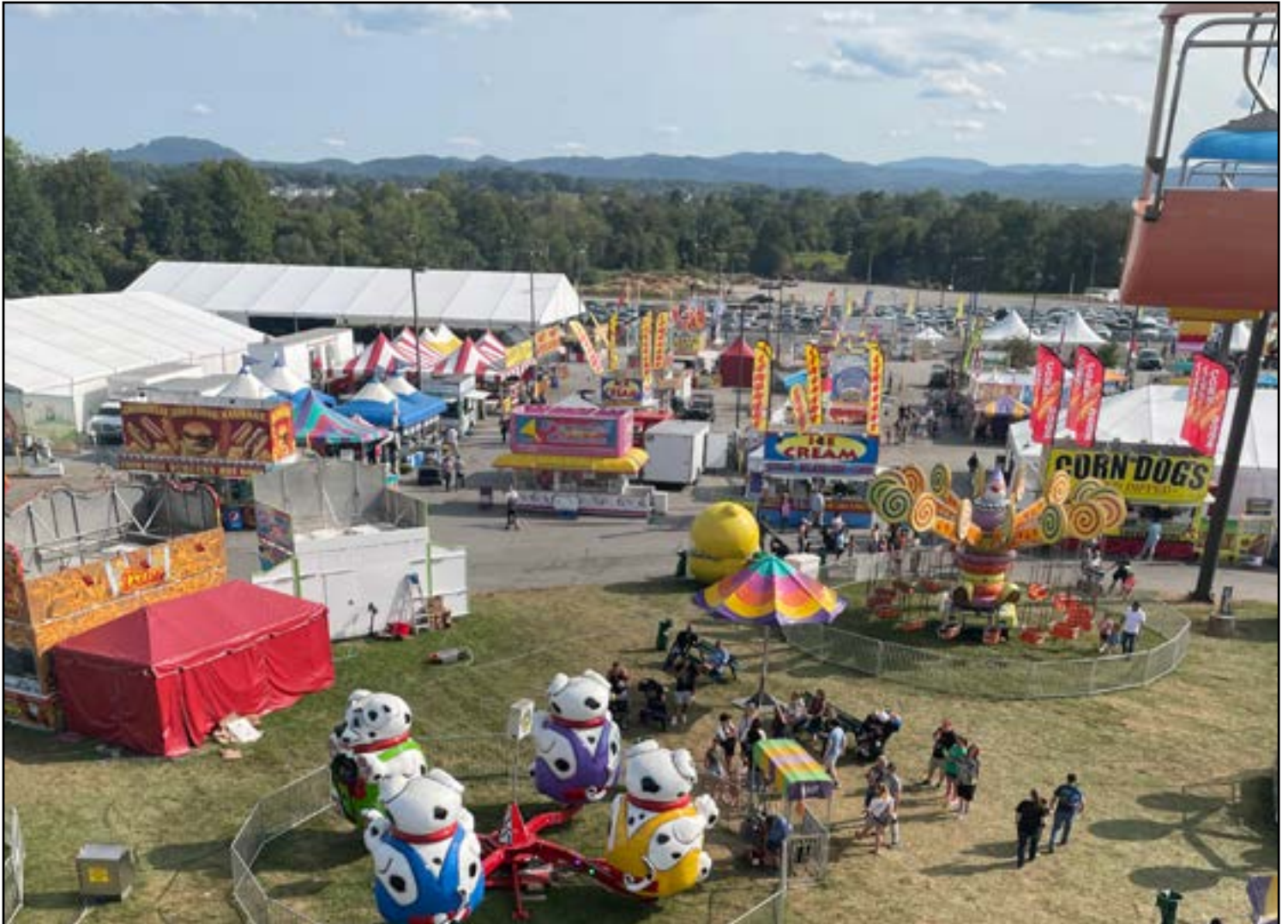
A view from the Ferris Wheel at the North Carolina Mountain State Fair.

The N.C. Mountain State Fair closes on Sunday, Sept. 15. Visit https://mountainstatefair.saffire.com/ for more information or to purchase advanced tickets.