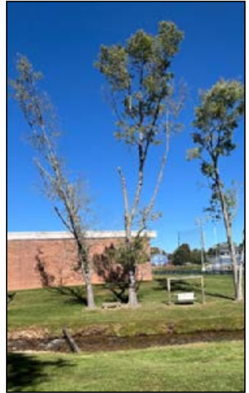
Trees by King’s Creek damaged by Helene’s winds.

Though this year’s fall colors may not be as vibrant as past years, nature is resilient and offers hope that the beauty will return once more next autumn. In the meantime, our community is reminded of the delicate balance in nature and how Hurricane Helene left her mark.