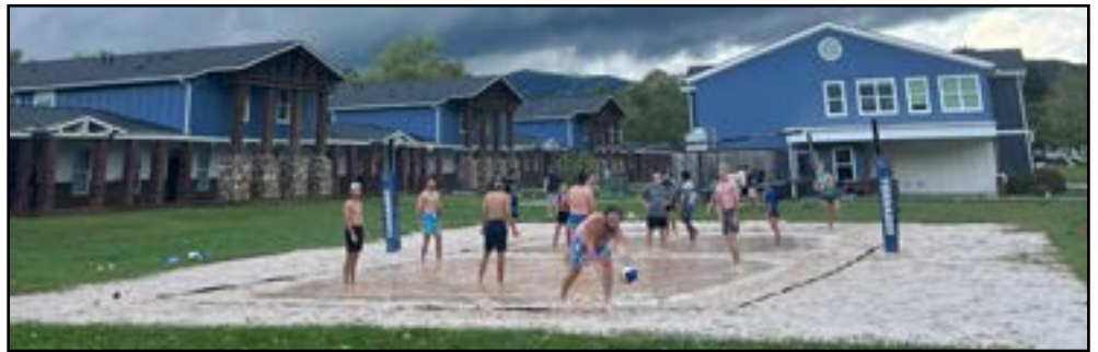
Students playing in flooded volleyball court.