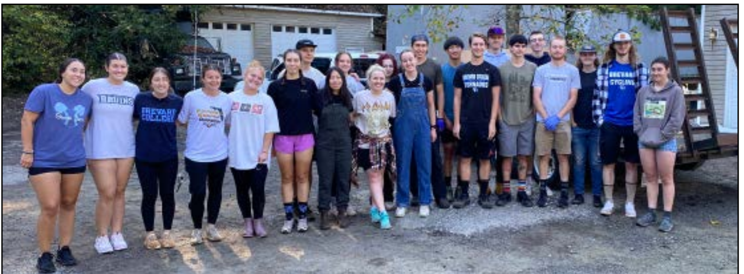
Brevard College student athletes help local families move their belongings in the aftermath of storm damage from Helene.

Some members of Brevard teams like cycling, softball, and volleyball were able to help a family just off of Asheville Highway to help recover their furniture after their first floor was flooded.