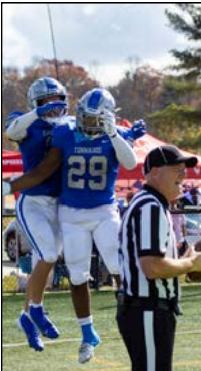
Tornado teammates celebrate during BC's senior day football game on Nov. 2.

BC returns to action on the road tomorrow, facing North Carolina Wesleyan Saturday, Nov. 9 at noon in Rocky Mount, North Carolina.