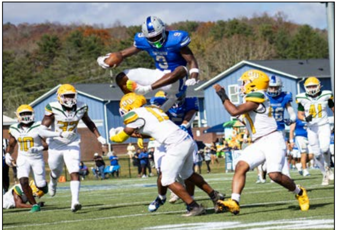
BC goes airborne in the Tornados' 44-21 drubbing of Methodist University on Nov. 2.