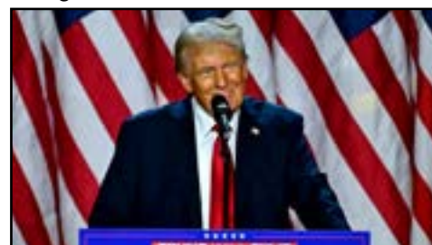
Donald Trump delivers his victory speech early Wednesday morning.

Time will tell in determining America's ability to reconcile as a nation in moving forward through this transition.