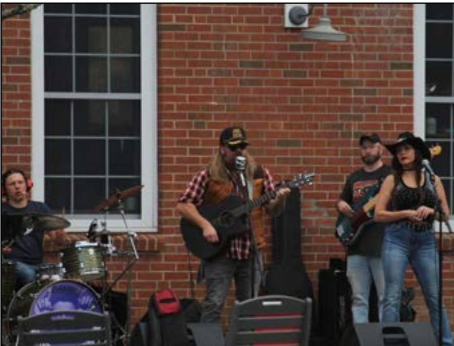
Left: Live music was provided at Harvest Fest 2024 by the Several Devils.

Harvest Fest brought the college and community together to give a break from the effects of Hurricane Helene.