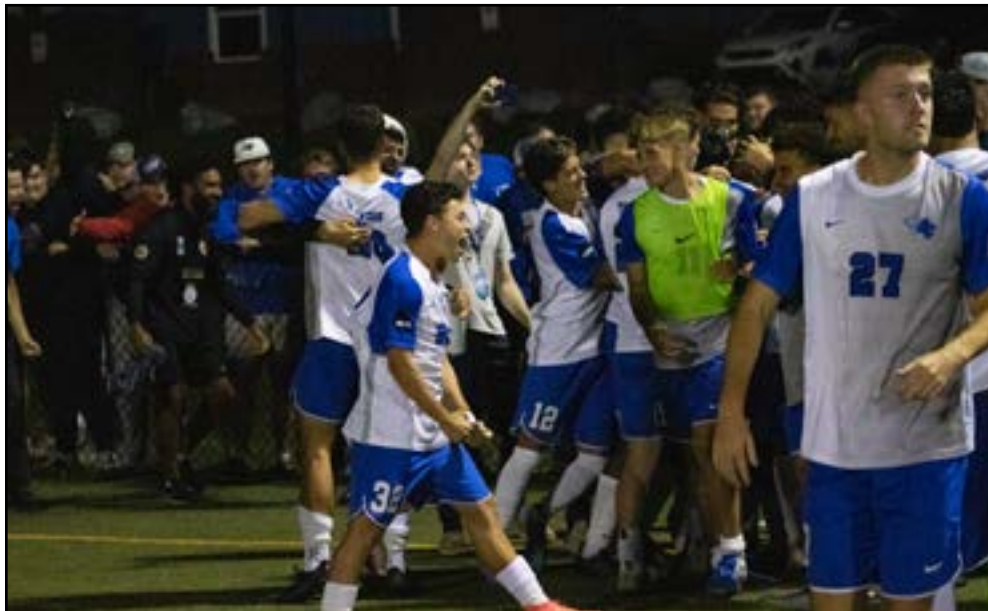
Both the men and women's soccer teams played a tournament doubleheader Wednesday as they each hoped to advance to play for a USA-South Conference championship.