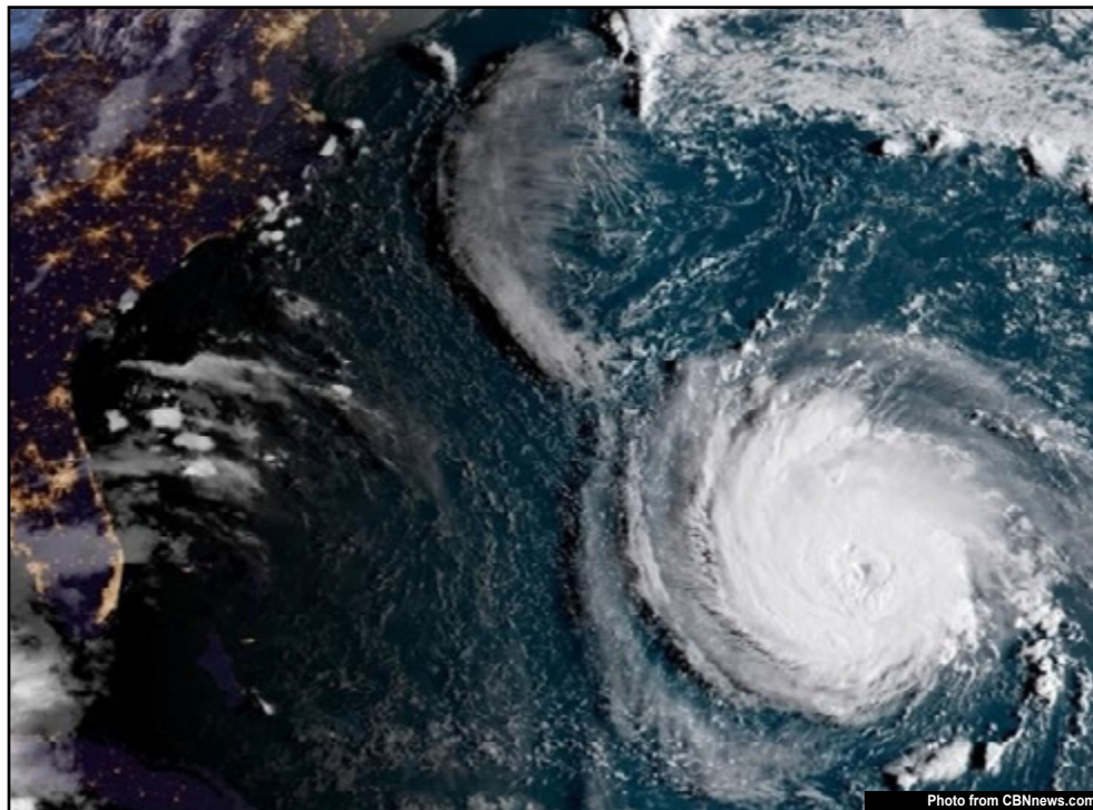
Aerial image of Hurricane Florence as seen on Tuesday morning as it heads towards South Carolina, North Carolina and Virginia. Some states have announced mandatory evacuations along the coastlines as the areas prepare for the damaging winds and potential floods.

The governors of North and South Carolina and Virginia have declared states of emergency along the coastal areas.