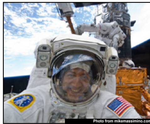
Dr. Mike Massimino grinning at the camera, with planet Earth in the background, during one of his space flight missions.

Massimino holds the team record for most hours spacewalking in a single space shuttle mission and is also the first man to Tweet from space, but his career did not end there.