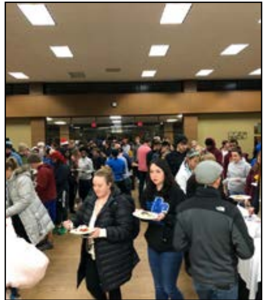
(Right) Myers Dining Hall filled with students taking a respite from finals week studying and playing in the snow.