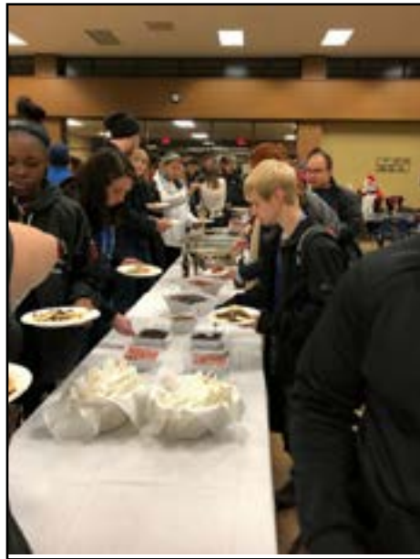
(Left) Students had plenty of toppings to choose from at Tuesday evening's Pancake Break.