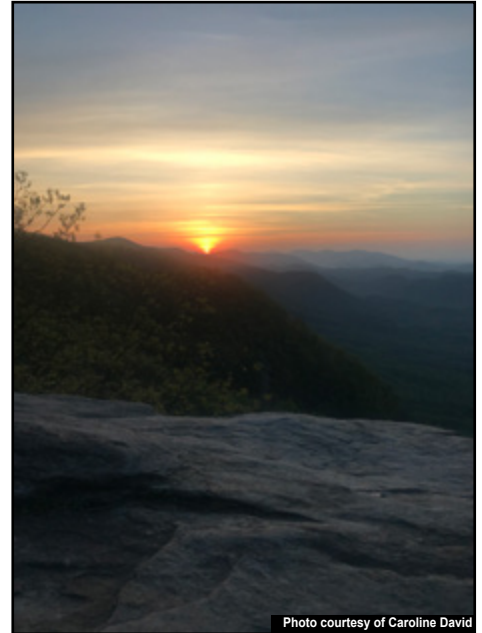
Spring in Brevard - 2018 (sunrise on the Blue Ridge Parkway).