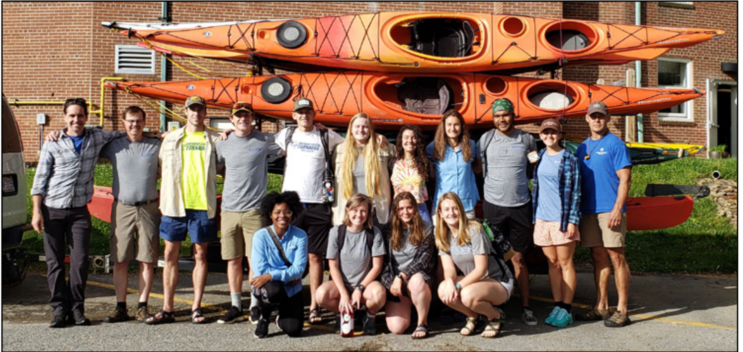
The 2019 VOR crew pose for a group photo on the BC campus Monday morning before embarking on their journey.

The 2019 Voice of the Rivers team left Monday for this year's expedition, following the Neuse River from its headwaters near Durham to Cape Lookout National Seashore on the Atlantic coast.