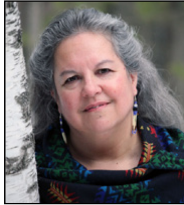
Robin Wall Kimmerer