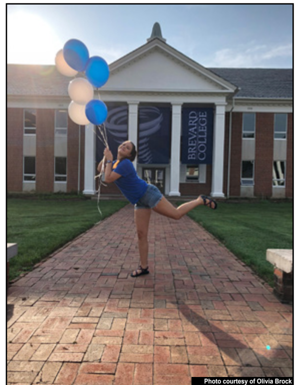
Welcoming new freshmen to the best four years of their lives.