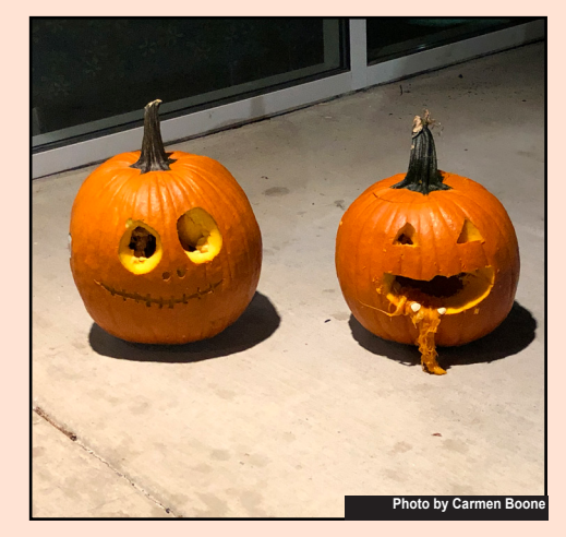
Pumpkins are carved up and left outside to make someone jump in the dark.