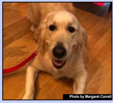
Maggie, a therapy dog, brought peaceful feelings to students at last Wednesday's event.

A person's mental health is something a lot of people do not pay attention to, which for some can be nothing but destructive. Being a part of this event made me feel good about myself knowing that I did some good for others. Finding a service project to take part in that you're passionate about can really change the experience.