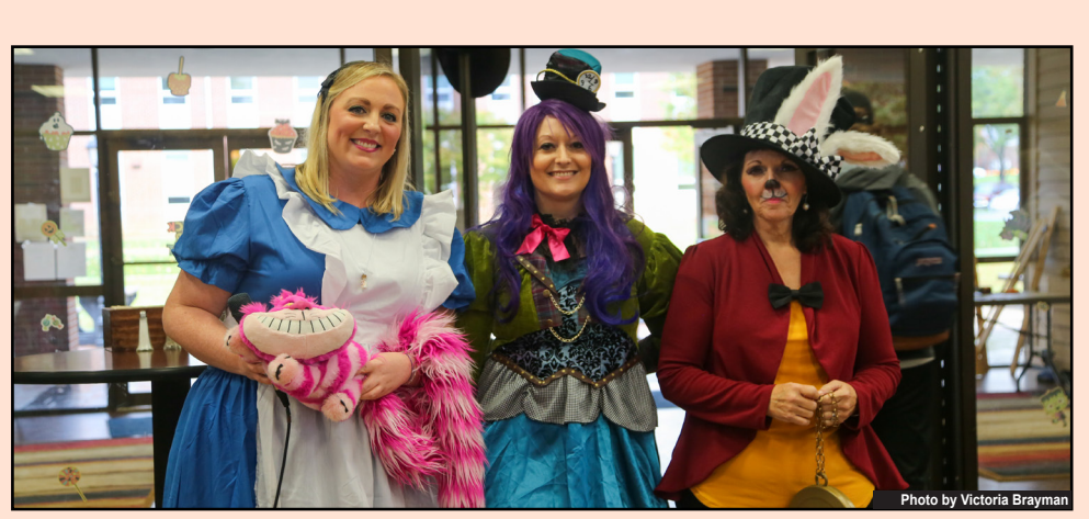
The registrar's office dresses up as 'Alice in Wonderland' characters.