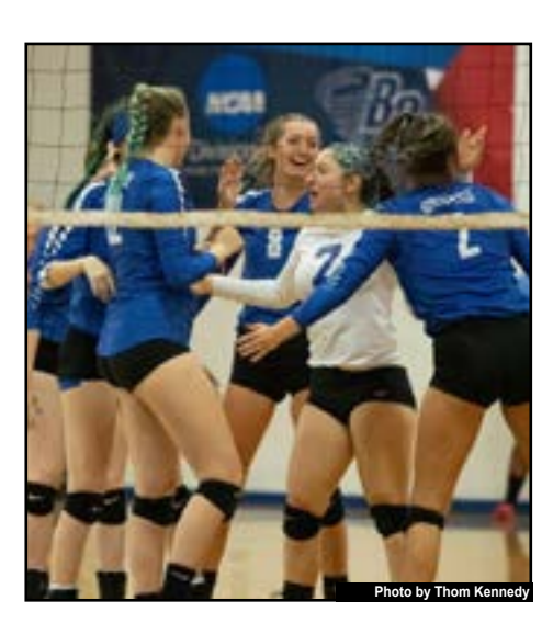
Tornados volleyball celebrate a win at Boshamer Gvm.

the Tornados on Twitter and Instagram @ bctornados, subscribe to 'Brevard College Tornados' on YouTube, follow 'Brevard College Tornados' on SoundCloud, or like Brevard College Athletics on Facebook. Be sure to follow "brevardcollege" on Flickr for the latest photos from all Brevard College events.