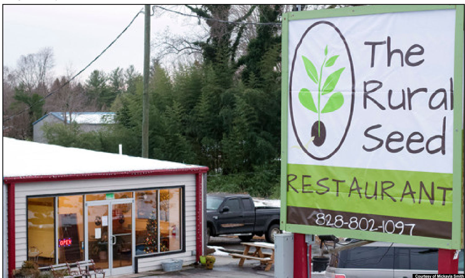
The Rural Seed Restaurant located in Columbus, NC.

Again, tip the servers. They are getting hit with a big blow to their bank accounts now. When you go to pick up food, tip the cashier. A lot of people don't feel the need to tip on a to-go order, but now is the time to do so because it could be the deciding factor of them keeping their jobs or losing them.