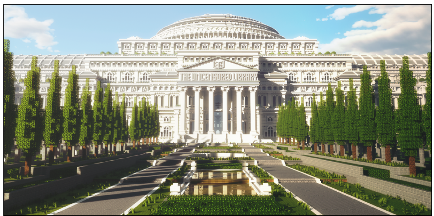
The entrance to The Uncensored Library, located in Minecraft. The library can also be accessed on the Web at uncensoredlibrary.com.

The building itself can be accessed through a downloadable map on uncensoredlibrary.com or through their online multiplayer server, visit uncensoredlibrary.com, on version 1.14.4.