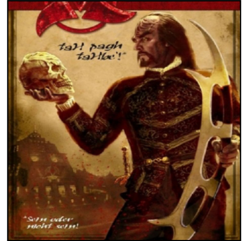
Shex'speare is always better with a bat'leth.

Other programs at school are joining in, with music professors teaching Klingon Opera, religion professors instructing Vulcan monastic rituals such as Kolinahr and BORG is self-explanatory.