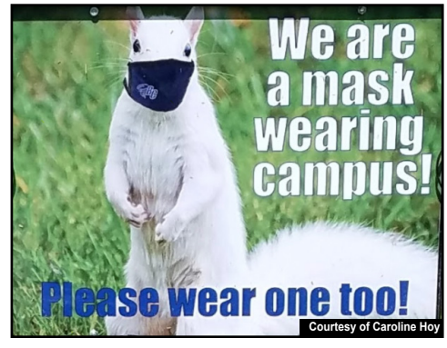
A picture of one of the many Brevard College mask signs encouraging the use of masks.