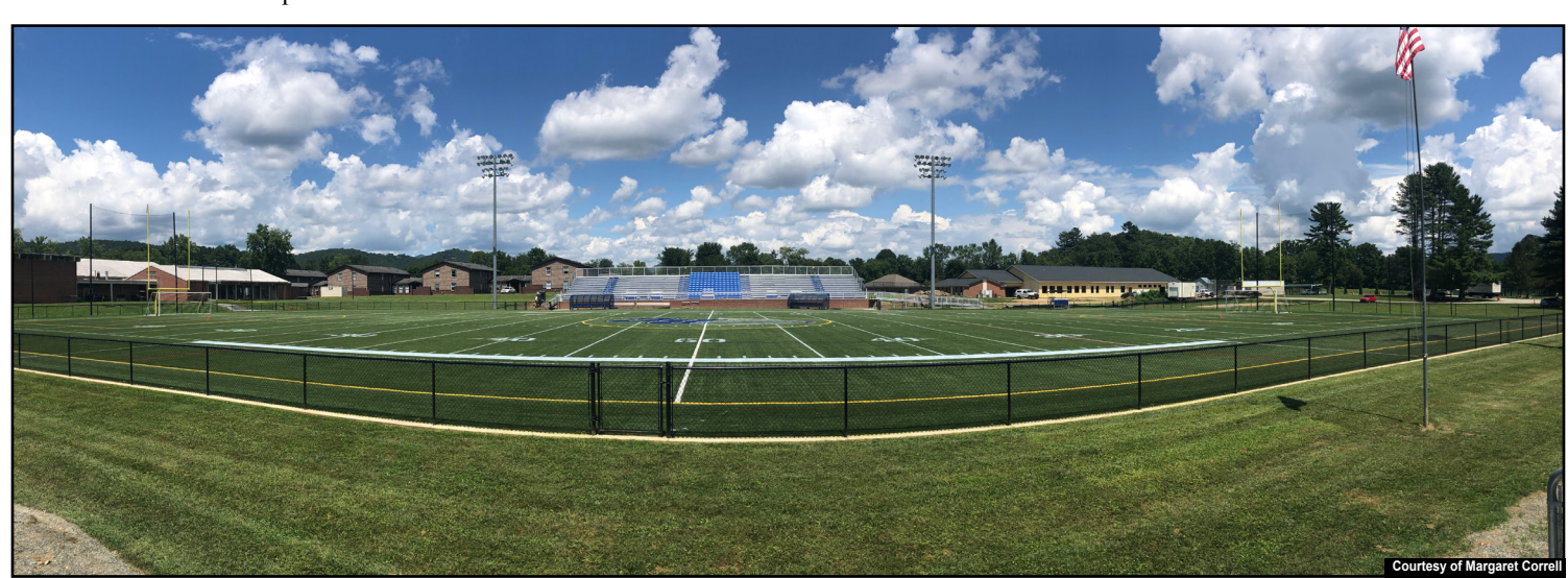
A view of the new football turf and home team bleachers from the visitor stands.