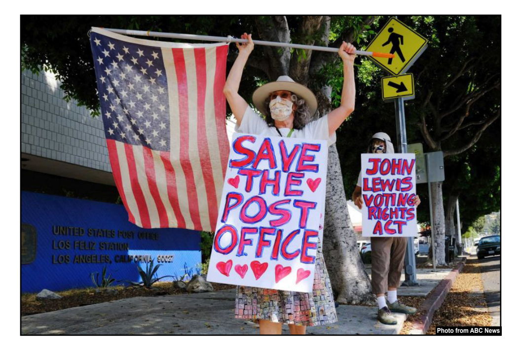
Many citizens protest the witholding of funding to the Postal Service which could potentially cause major delays for mail-in voting.

"The president's comments today affirm that no patriotic tradition is immune from his abuse of power," they said. "The president made plain that he will manipulate the operations of the post office to deny eligible voters the ballot in pursuit of his own re-election."