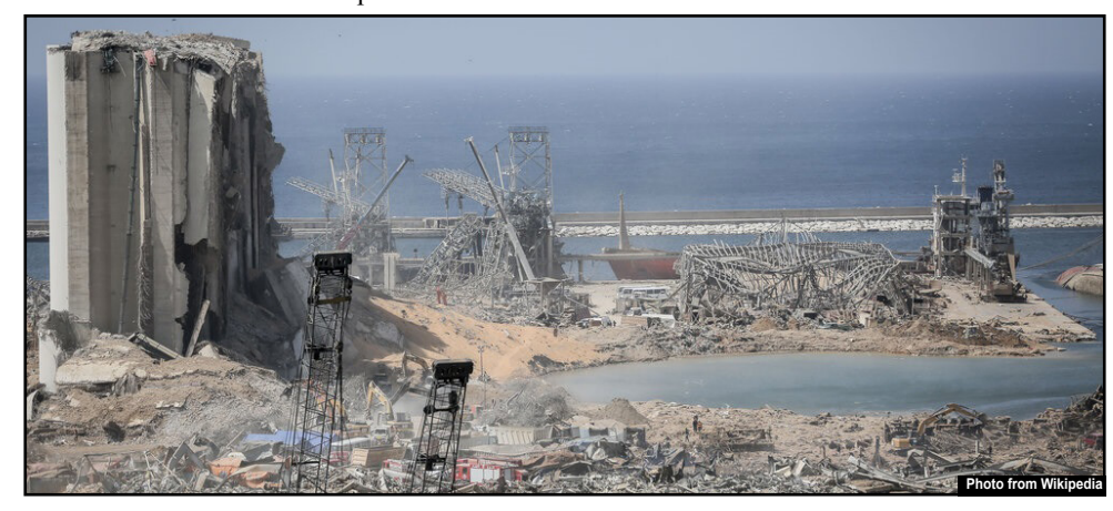
The aftermath of the 2020 Beruit explosions.

To donate directly to the Lebanese Red Cross please visit https://supportlrc.app/donate/donate guest.html