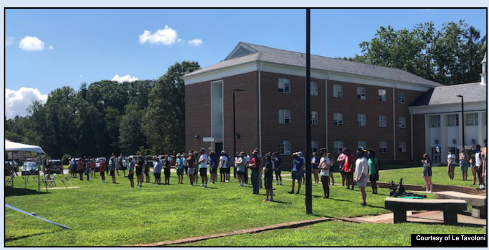
First-year students take part in many Creek Week activites while preparing for the life on campus.