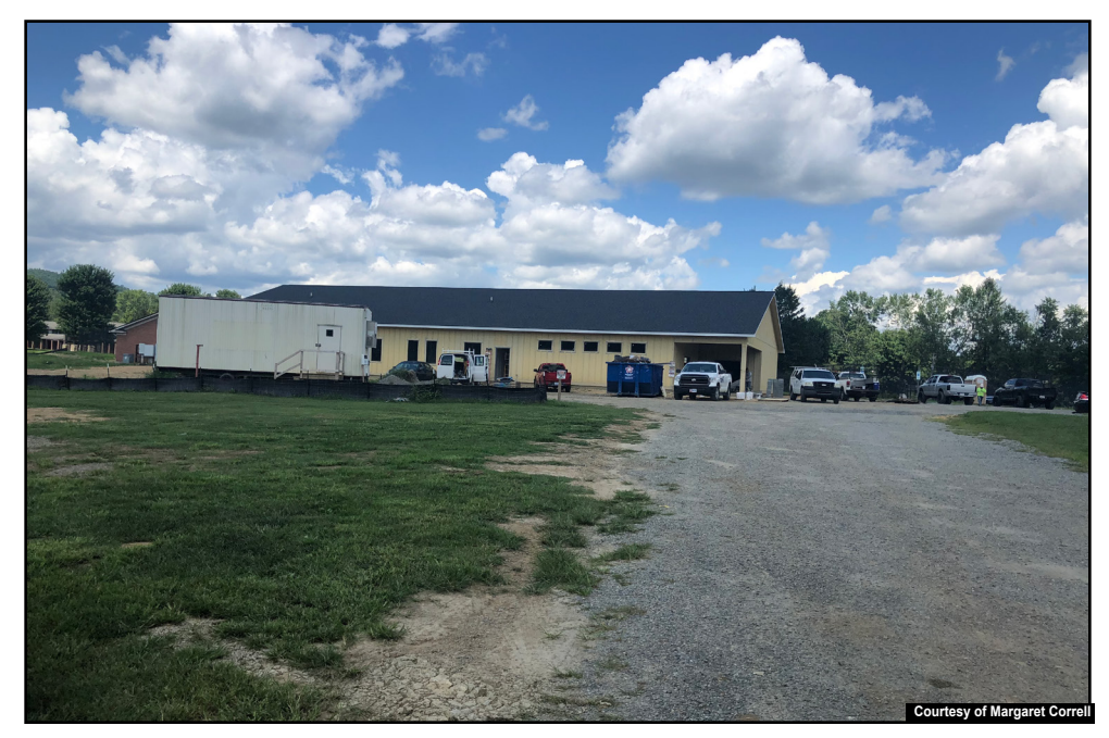
The athletic building under construction.

Construction for the athletic building is set to end Sept. 30, 2020. Plans for a press box to be added to the BC stadium are set for the spring.