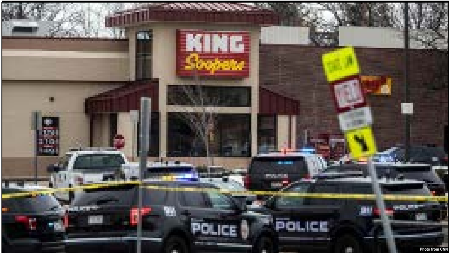
King Soopers supermarket parking lot flooded with police in response to shooting, Boulder, Colorado.