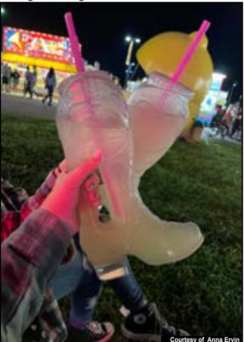
Cowboy lemonade from the fair concessions.

More information can be found on www. wncagcenter.org.