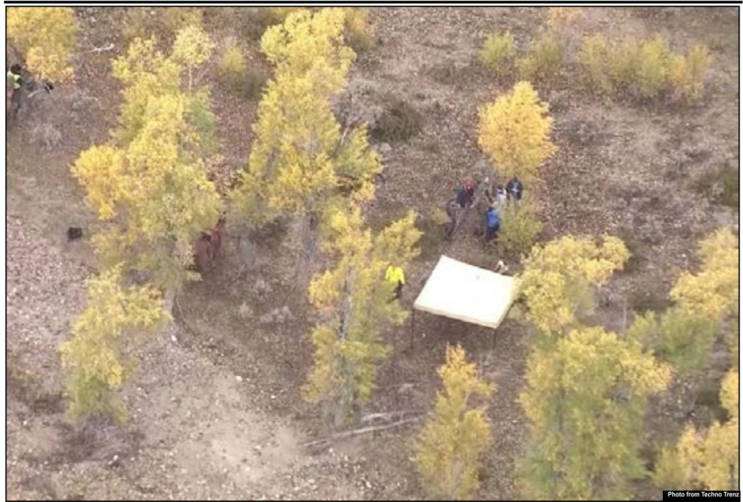
Helicopter captured photo of Bridger-Teton National Forest, where Gabby Petitio's remains were found.