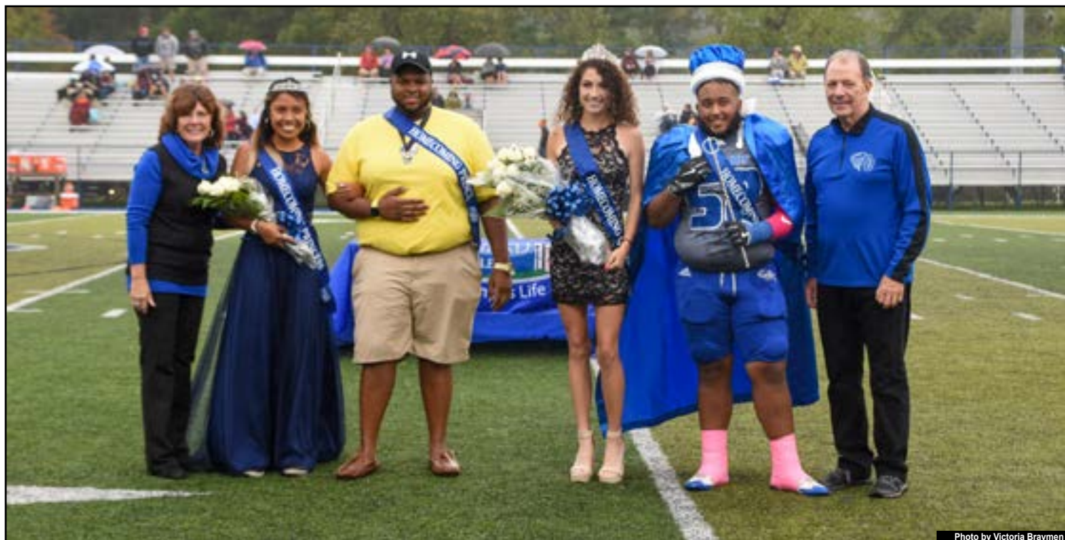
2019 homecoming court

Wednesday, Oct. 6, there is a scavenger hunt all day that ends in a raffle for $50. There is also a car wash for cans from 2 p.m. to 6 p.m.; bring five cans to get your car cleaned. The evening event is powderpuff at 9:30 p.m., with underclassmen in white battling upperclassmen in black