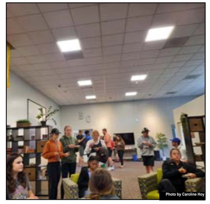
Students do activities to help CREDO figure out the next big project on campus! CREDO is an outside source that comes to Brevard College to work with students to find out what projects the school should do in the future.

Chick-Fil-A sandwiches were provided and many students showed up to get some free chicken and cookies!