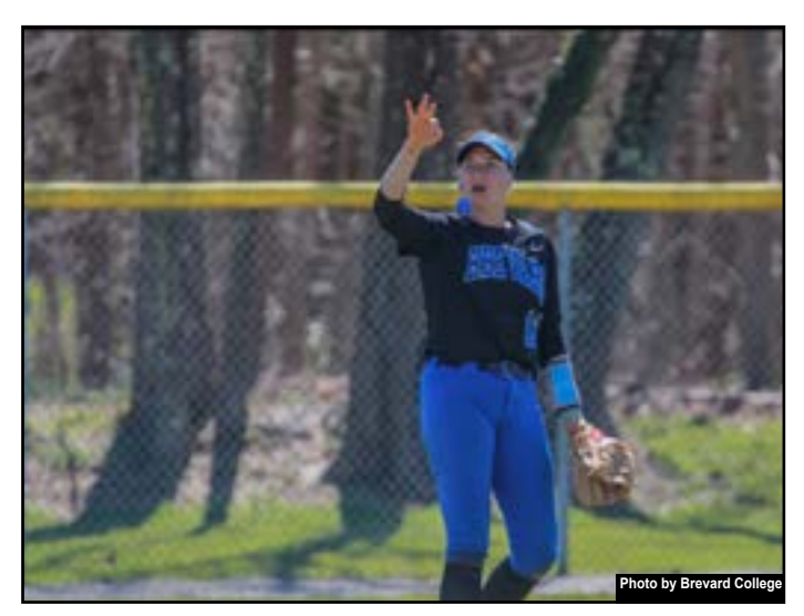
A photo of a BC softball athlete.