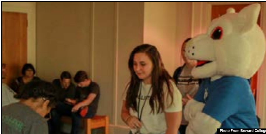
Even Nado got in on the action helping students with check-in at SOAR.