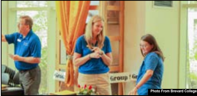
Brevard College staff prepares for SOAR!