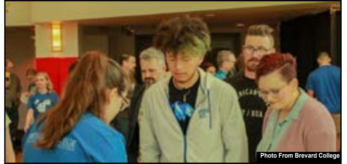
Potential students register for classes.