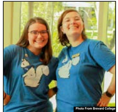
Brevard College Staff excited to help future students at SOAR!