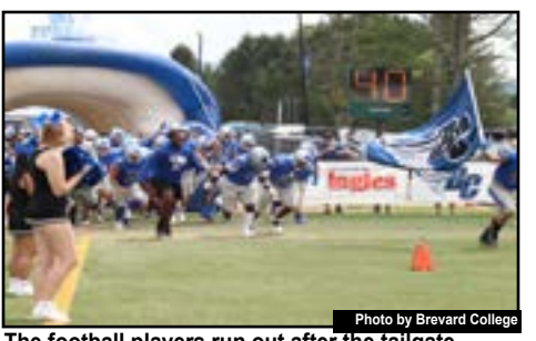
The football players run out after the tailgate.

EVERY home game this season, and it's located at the sand volleyball court! They always start three hours before kickoff. There's free food, games, and music! Come stop by before every home football game to get ready to cheer on our Tornados week in and week out!