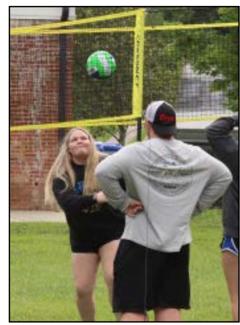
Students enjoy fun games outside of the dining

You'll find your place within the school, you just need a little courage to try something new. Take some friends, and go on an adventure!