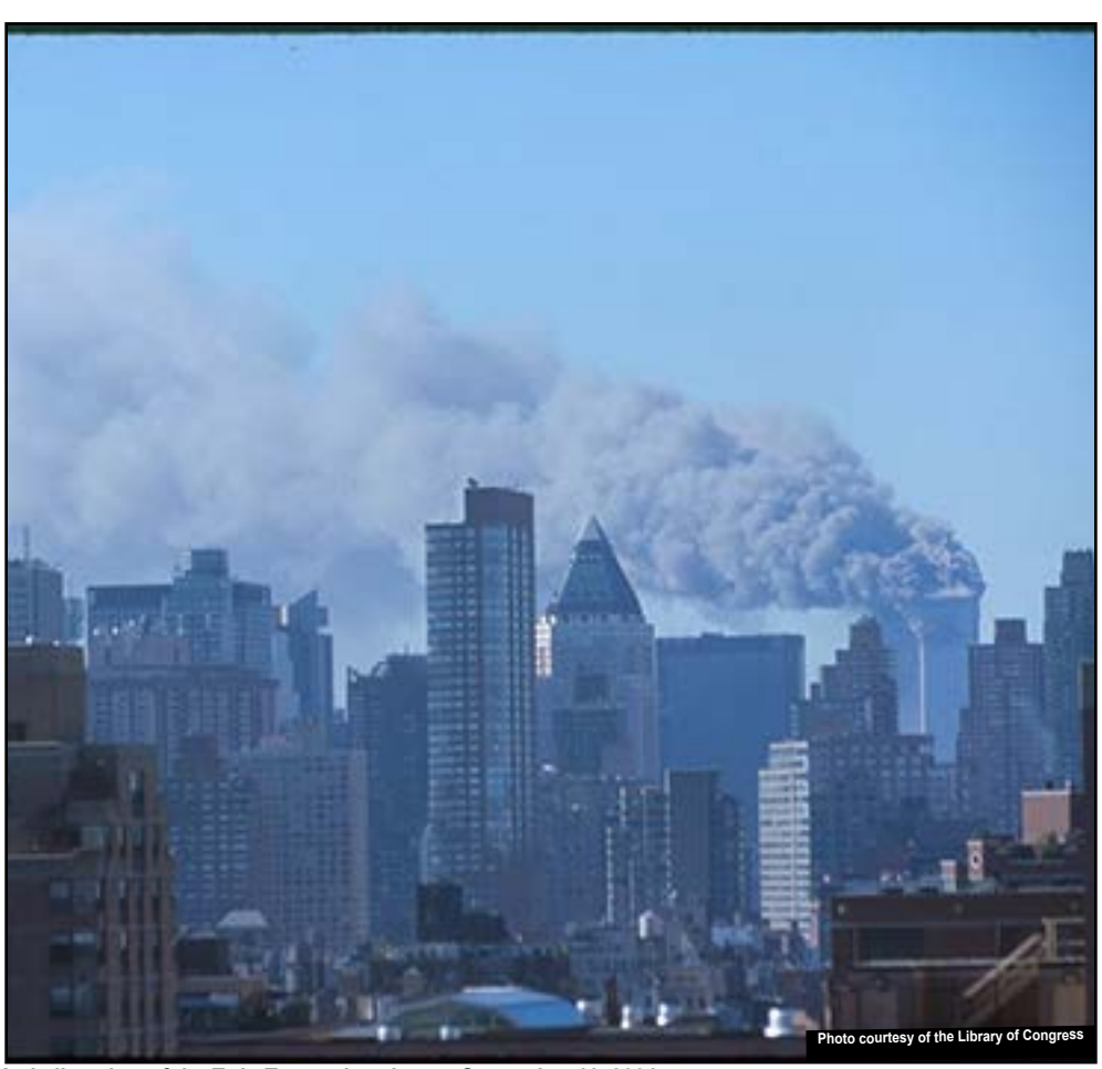
A skyline view of the Twin Towers burning on September 11, 2001.

☑ Letters Policy: The Clarion welcomes letters to the editor. We reserve the right to edit letters for length or content. We do not publish letters whose authorship cannot be verified.