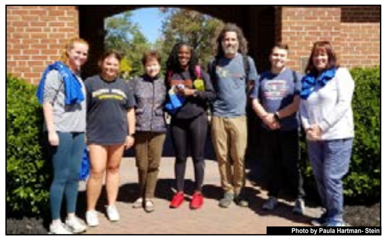
Ready for the Blue Zone walk to start!