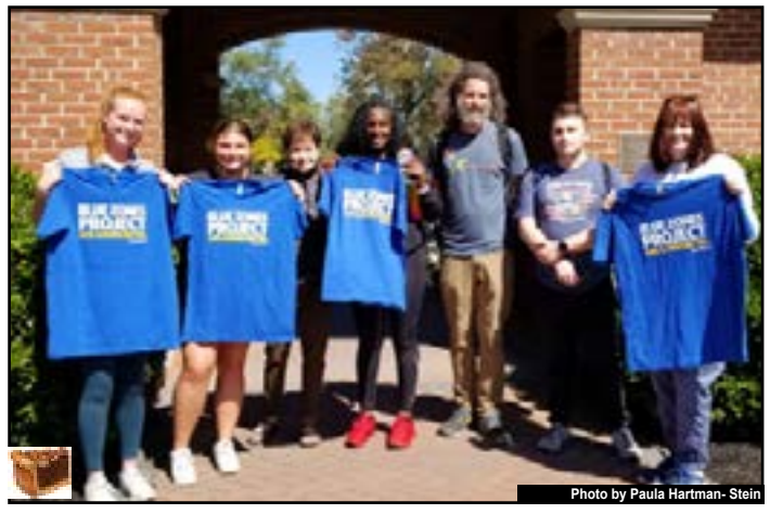
Everyone excited for their new Blue Zone shirts!

For more information on the topic please look at the link <u>here</u> that Hartman- Stein has provided for additional information. If you are interesting in going please follow up!