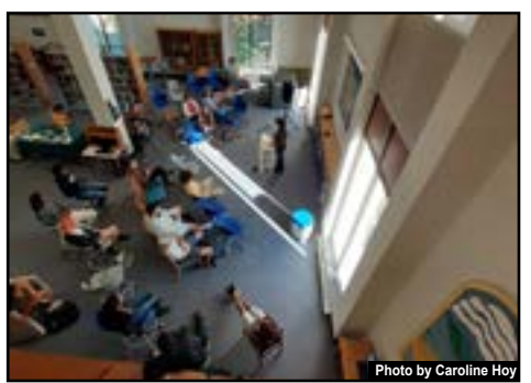
One didn't even need to sit with everyone else. A wonderful view of the reading could be seen and heard from the second floor.