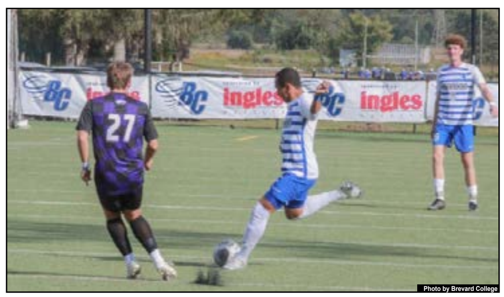
Men's soccer plays hard and wins again!

The first conference game this season was thus won. BC men's soccer now heads into their next game on Oct. 5 at 7:00 p.m. against Johnson & Wales at Ives-Lemel Family Field with a record of 6-3.