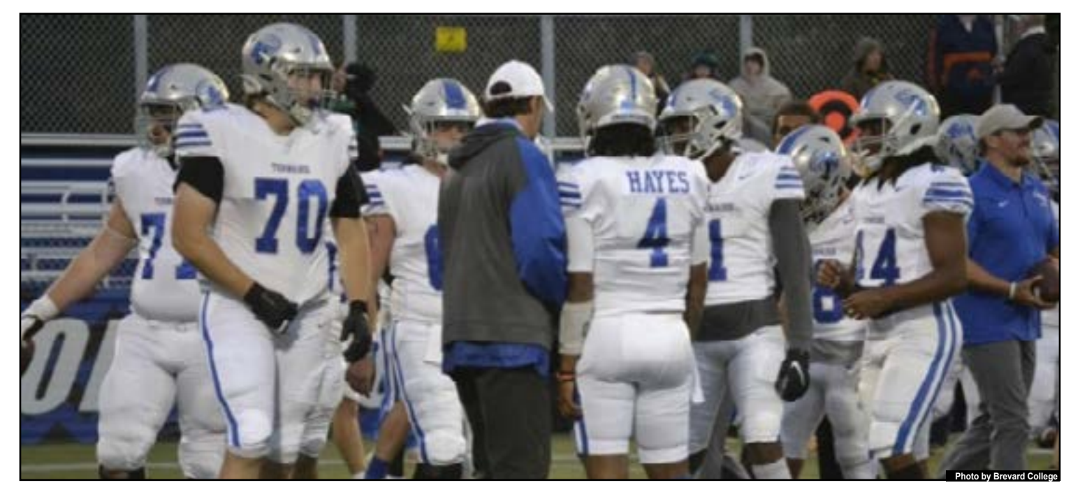
Football team is excited for their first FNL game and in the rains of a hurricane to boot!

The Nados take on Methodist this Saturday at Ives-Lemel for their homecoming game. Kickoff is at 2 p.m.