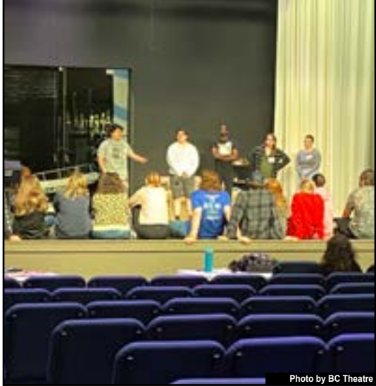
The theatre majors of Brevard College take the stage at North Iredell High School in Statesville, NC